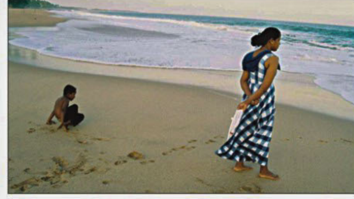
(Clockwise from left): Scenes from "The Promised Land", "The Way of the Road" and "Mayomi".