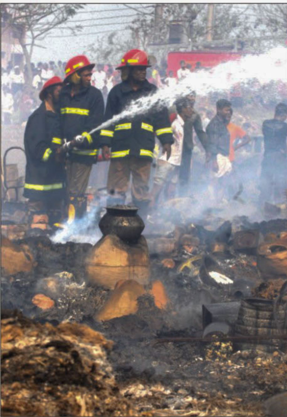
Firefighters spray water to put out a fire at a city slum in Mohamadpur embankment area yesterday.