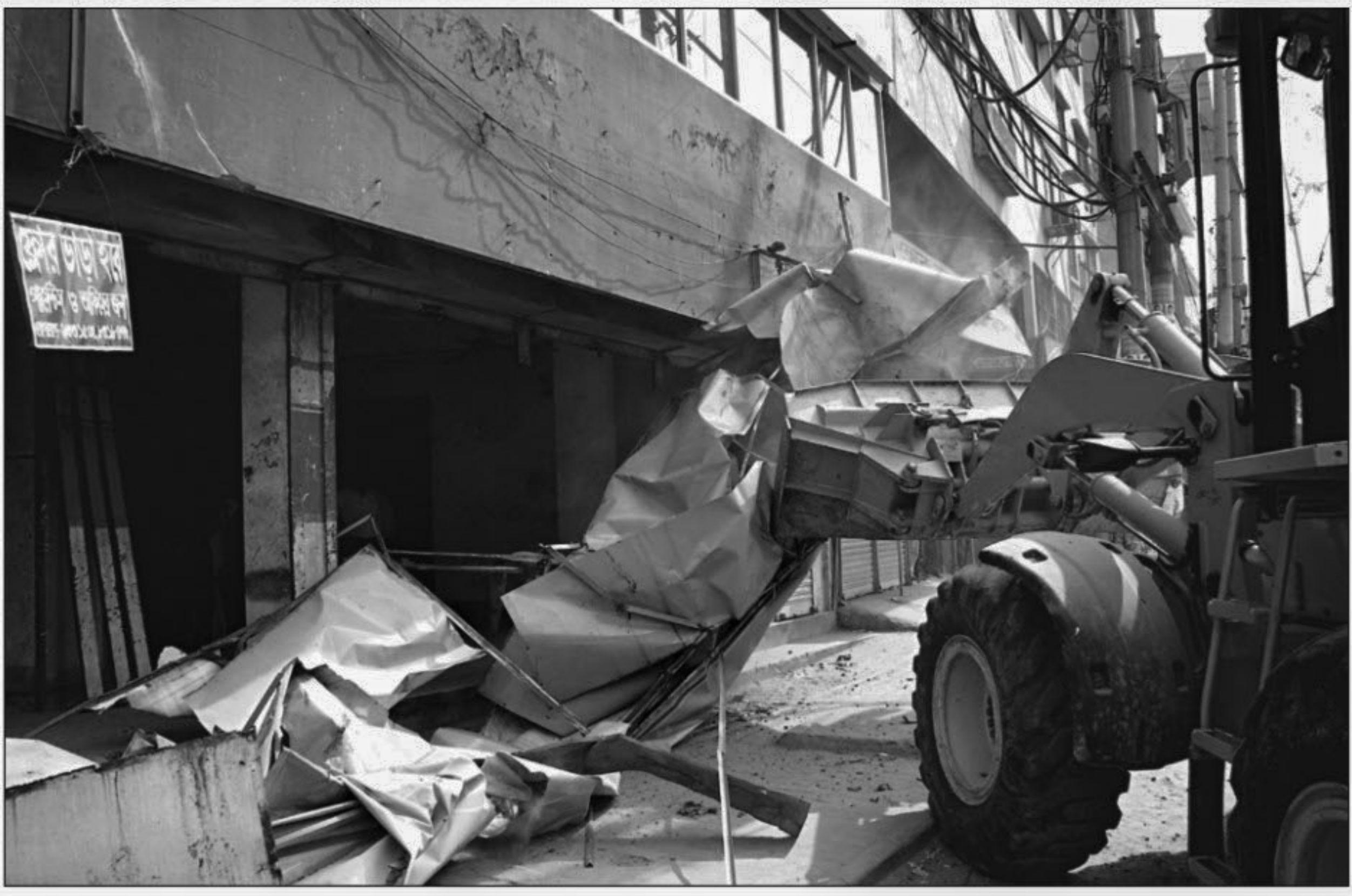
Rajuk demolishes illegal structures at Purba Hajipara on DIT Road in the city yesterday.