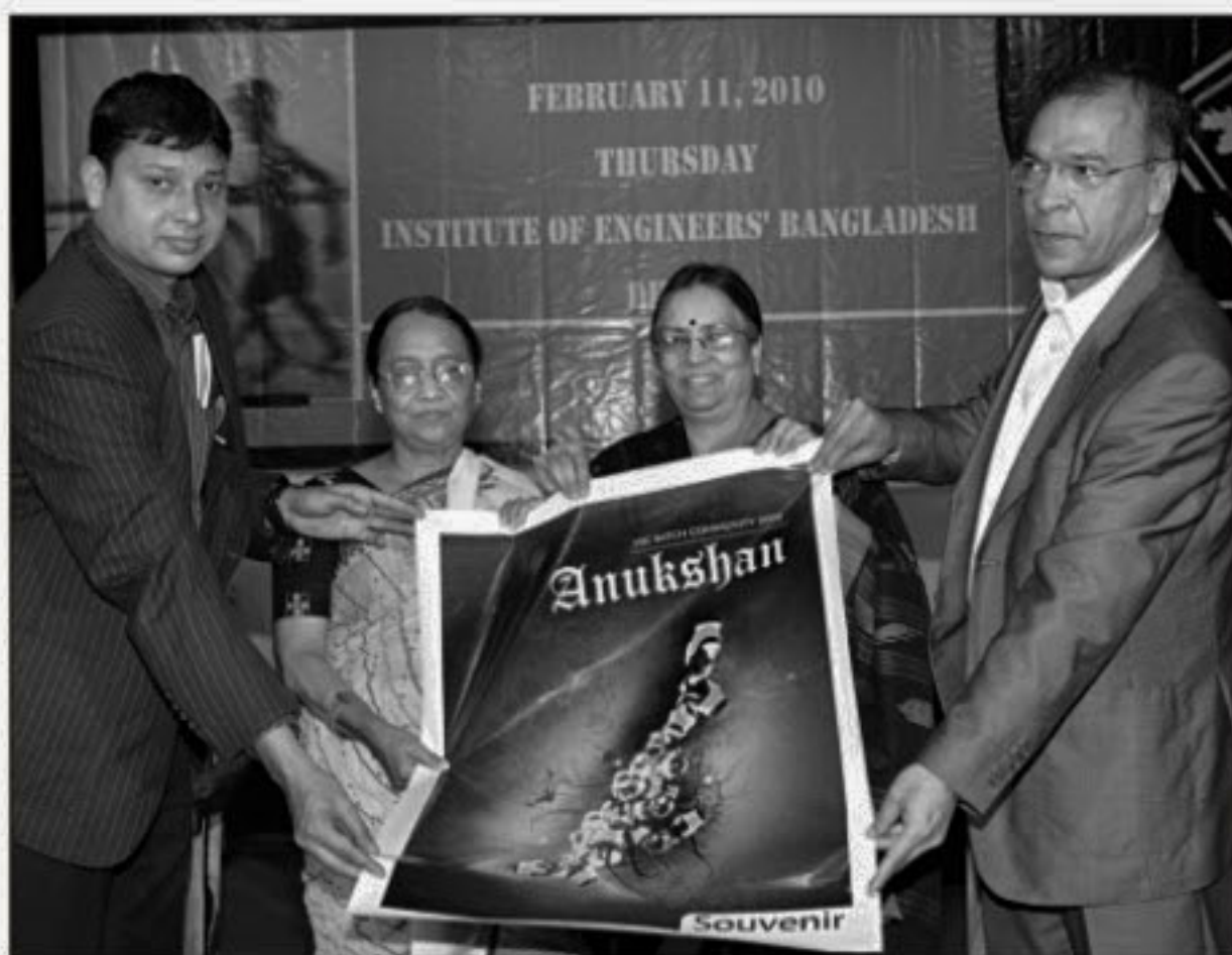
Advocate Sultana Kamal and writer Selina Hossain launch the souvenir of Anukshan, an organisation of HSC Batch Community 2009, at a youth festival at the Institution of Engineers in the city yesterday. On their left is TIB Executive Director Iftekharuzzaman.

It is not enough just to talk against corruption and dreaming of a poverty-free country, rather the youths of today must wage a united social movement and work in their own capacities to see their dream come true. That was the electrifying determination expressed by students at a youth festival yesterday. They debated, sang, danced and performed in drama and fashion show, but the central point of all was how they could energise the spirit of the youths, saying it was the youths who played significant roles in all the stages of the country's liberation. Anukshan, an organisation of HSC Batch Community 2009, organised the programme 'My Bangladesh: Well Governed Bangladesh' in association with Transparency International Bangladesh (TIB) at the