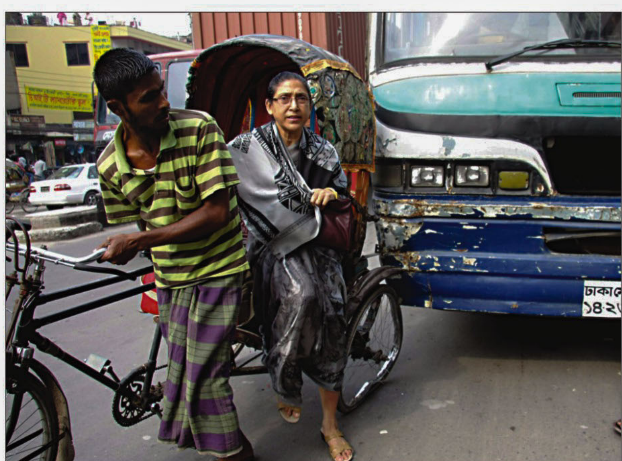
A bus hits a rickshaw breaking the three-lane system on DIT Road at the city's East Rampura yesterday.