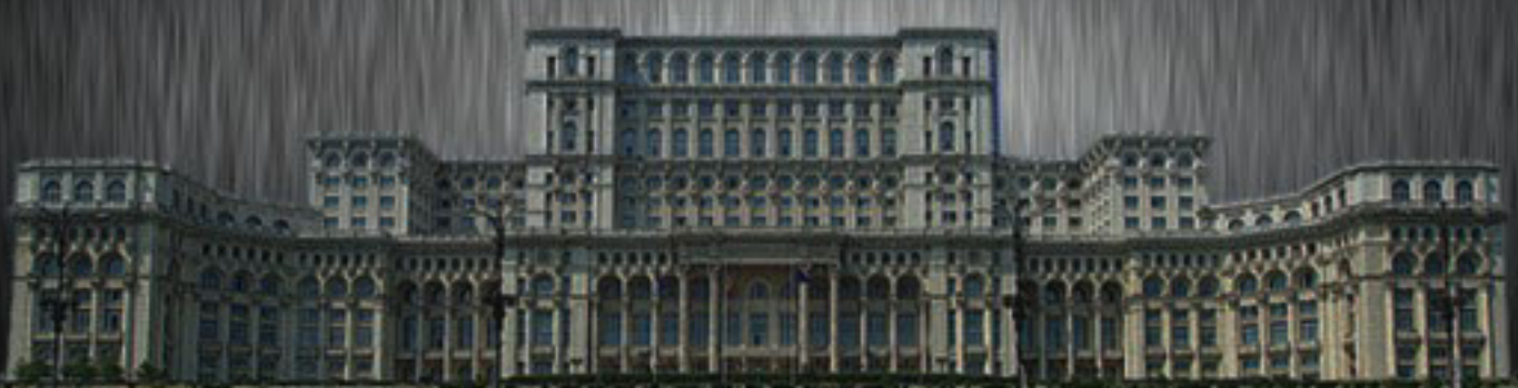
The fascinating world of construction. Brought to you by:

According to the Guinness Book of World Records, the Palace of the Parliament in Bucharest, Romania, is the world's largest civilian administrative building, most expensive administrative building, and heaviest building. It measures 270m by 240m, 86m in height, plus another 92m under ground.