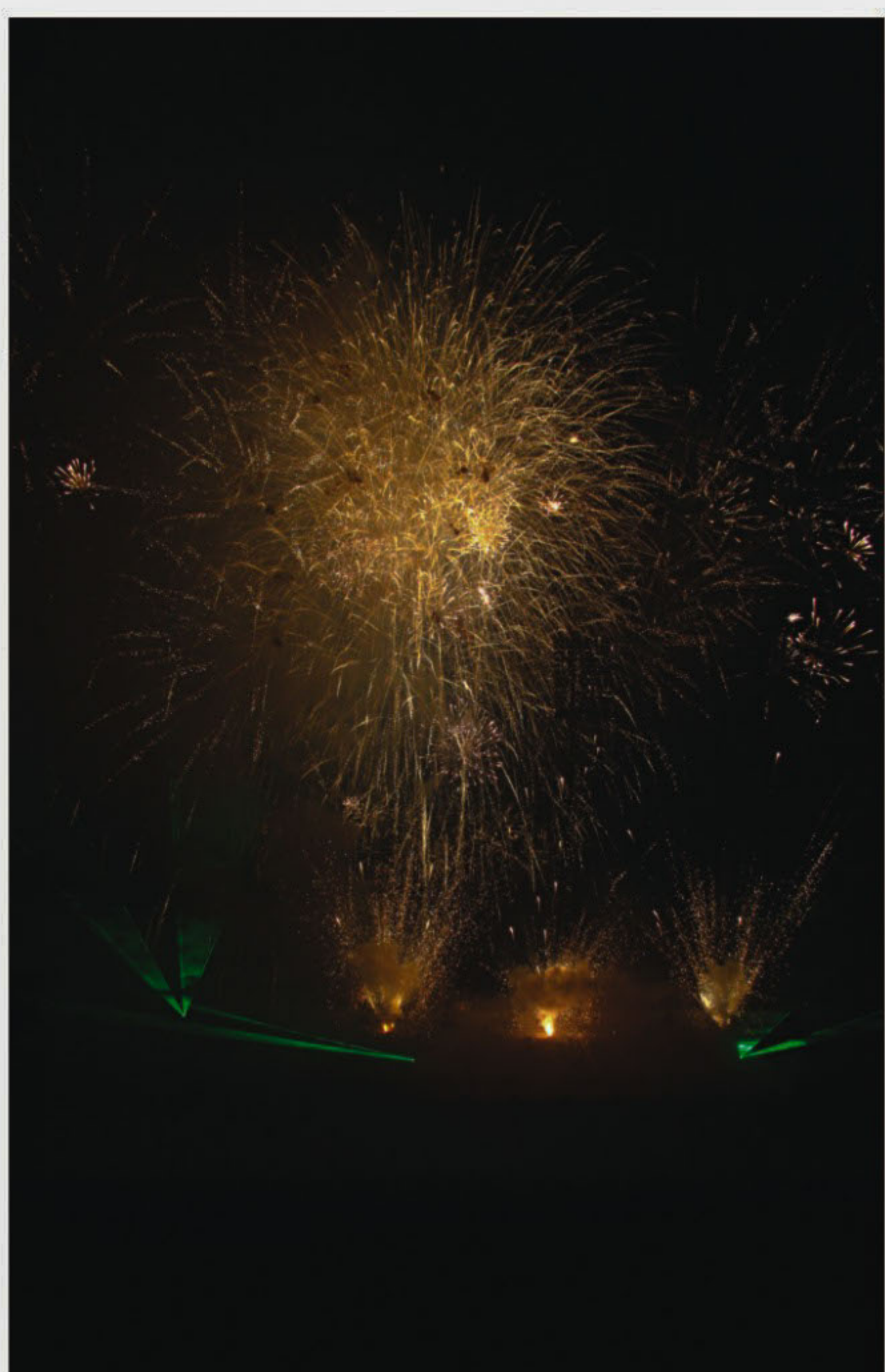
Spectacular fireworks accompanied by laser show light up the night sky over Bangabandhu National Stadium during the three-hour gala closing ceremony of the 11th South Asian Games yesterday.