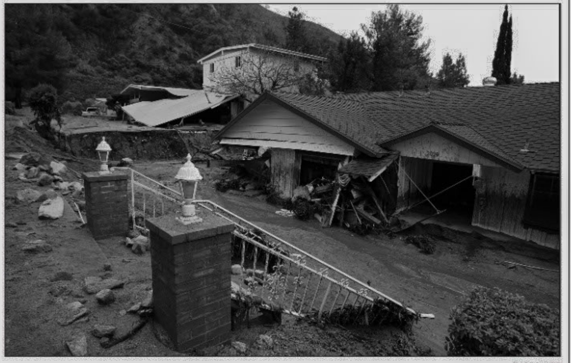
Debris flow damages a home after heavy rains caused mudslides on Saturday in La Canada Flintridge, California. Large wildfires in 2008 and 2009 stripped the hills and mountains of vegetation, resulting in mud and debris flow danger as winter rains pass over foothill communities where thousands of people have been evacuated at times in recent weeks.

Human Rights Watch said yesterday that Israel has failed to properly investigate alleged crimes committed during last winter's devastating Gaza war as demanded by the United Nations.