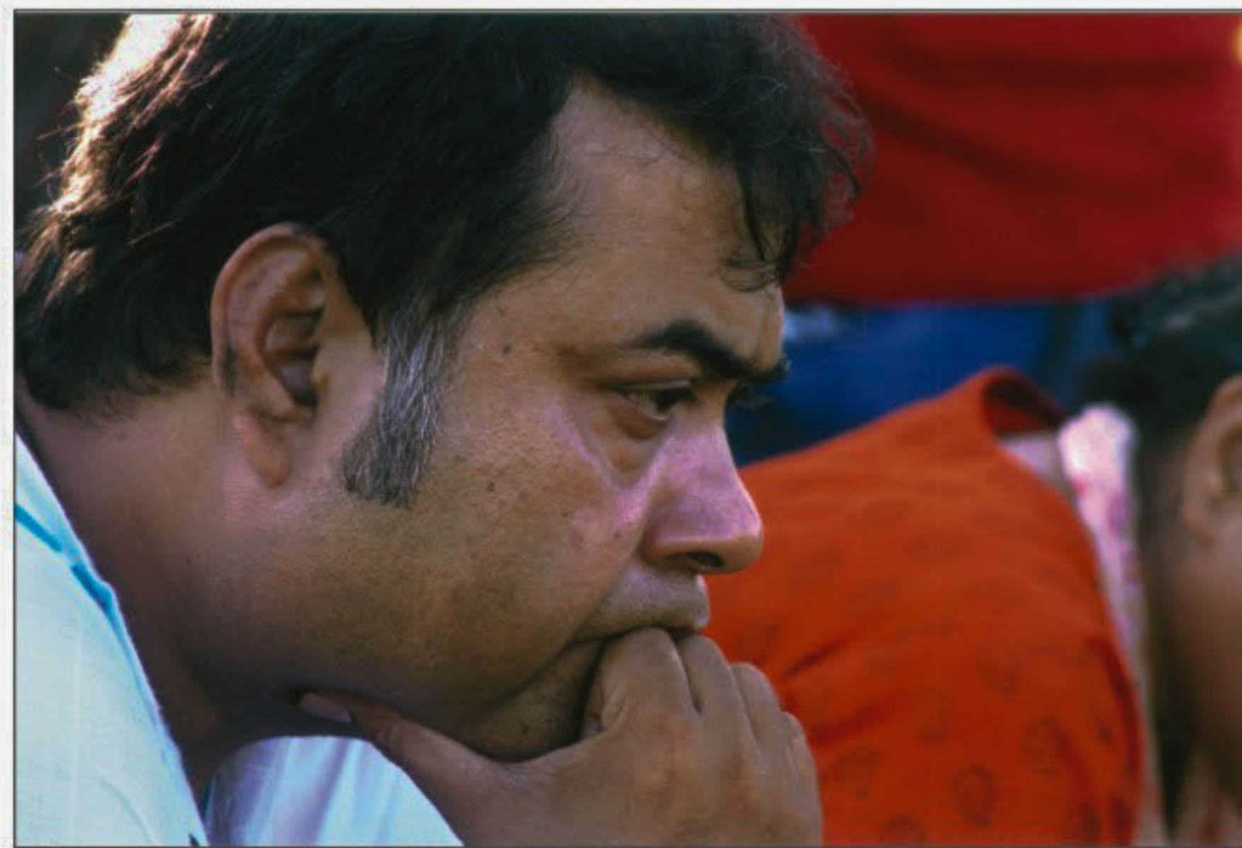
Sachchu plays a special character in the telefilm.