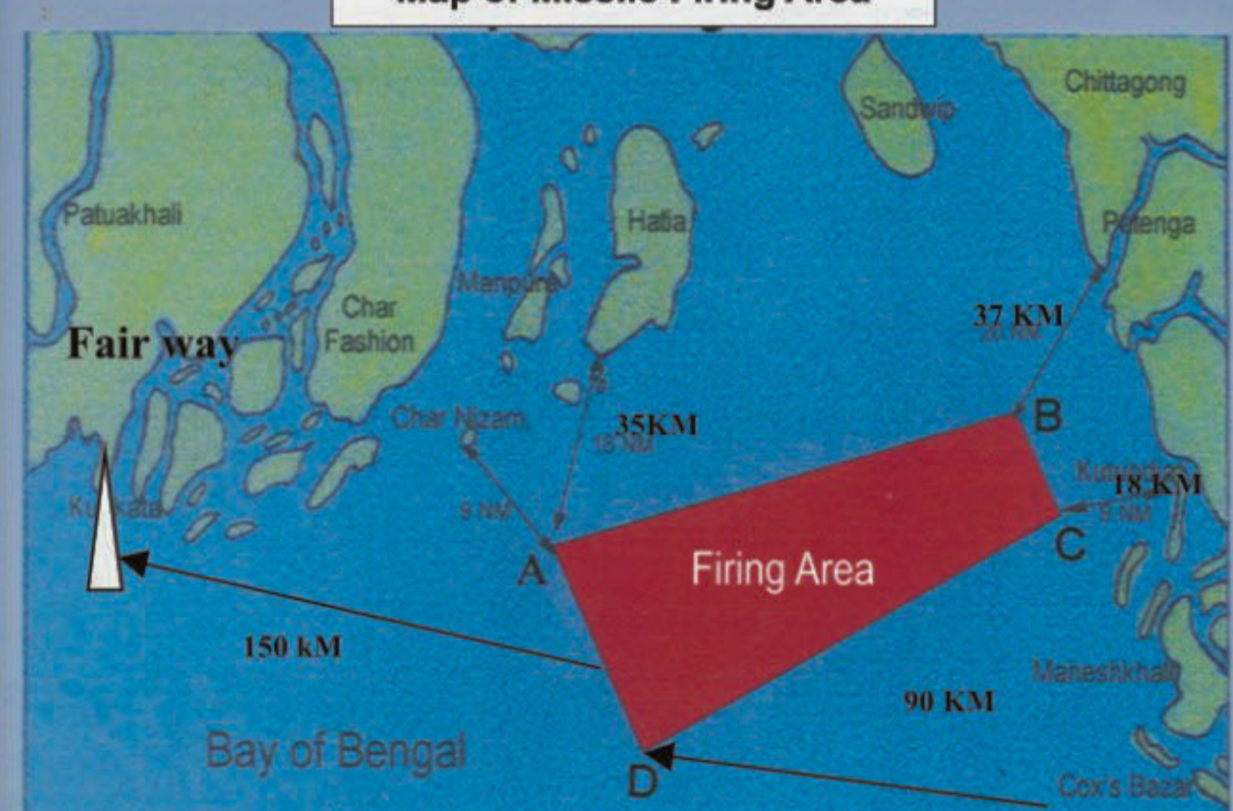
Map of Missile Firing Area

BANGLADESH NAVY SHIPS WILL CARRY OUT LIVE MISSILE FIRING FROM SATURDAY TO MONDAY (06 TO 08 FEB 2010)