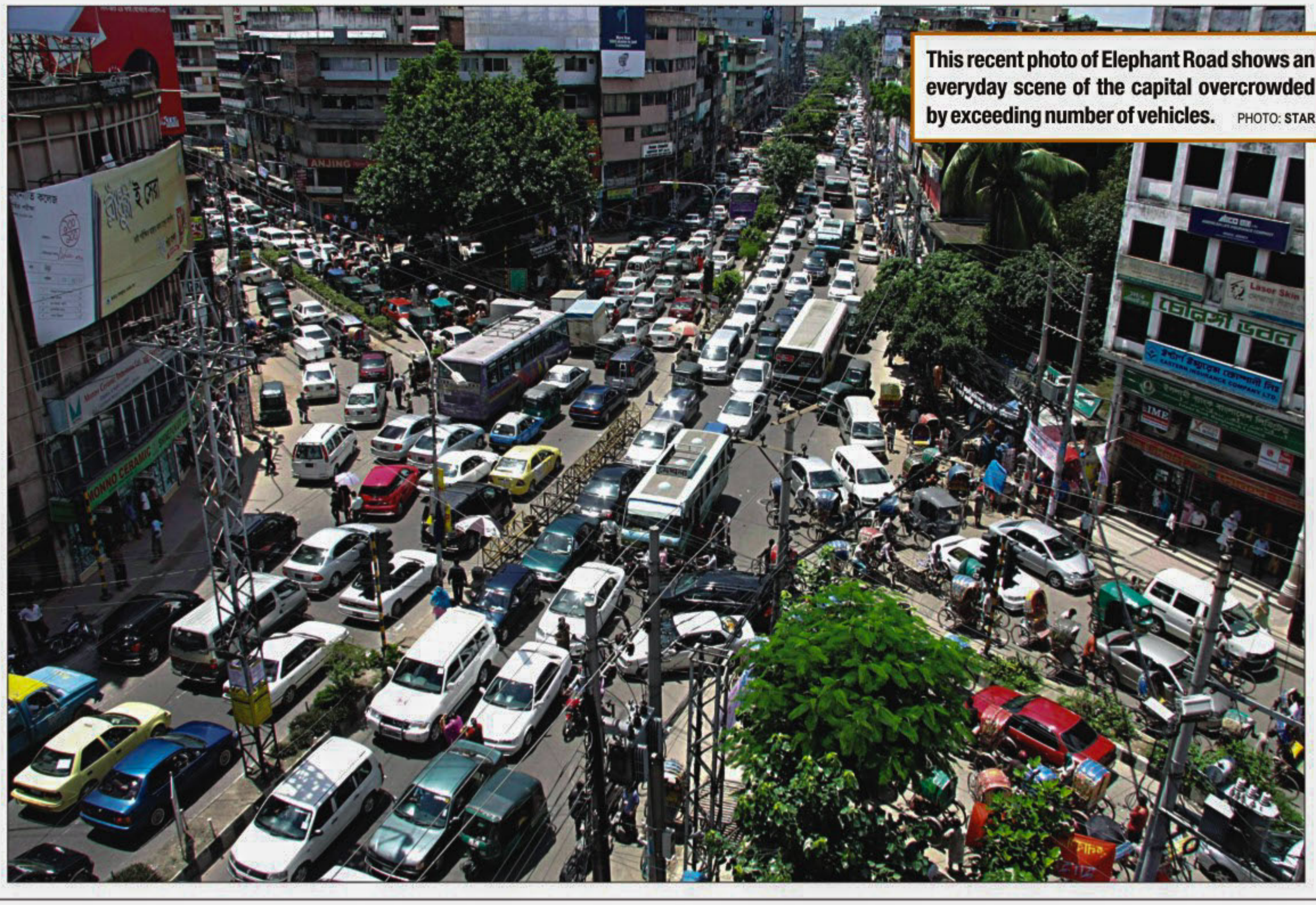
This recent photo of Elephant Road shows an everyday scene of the capital overcrowded by exceeding number of vehicles.