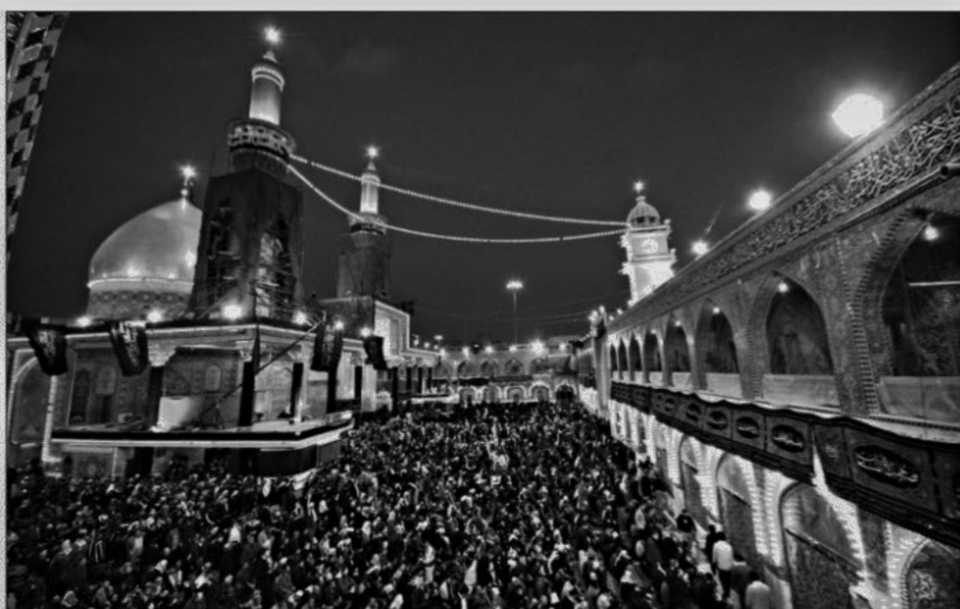
Muslim Shia pilgrims gather outside the Imam Abbas shrine in the Iraqi holy city of Karbala, 110km south of Baghdad, to mark the Shia mourning day of Arbaeen on Thursday. Arbaeen marks 40 days after the Ashura anniversary commemorating the slaying of one of Shia Islam's most revered figures, Imam Hussein (RA), who was slaughtered by the armies of the Sunni caliph Yazid in 680 AD.