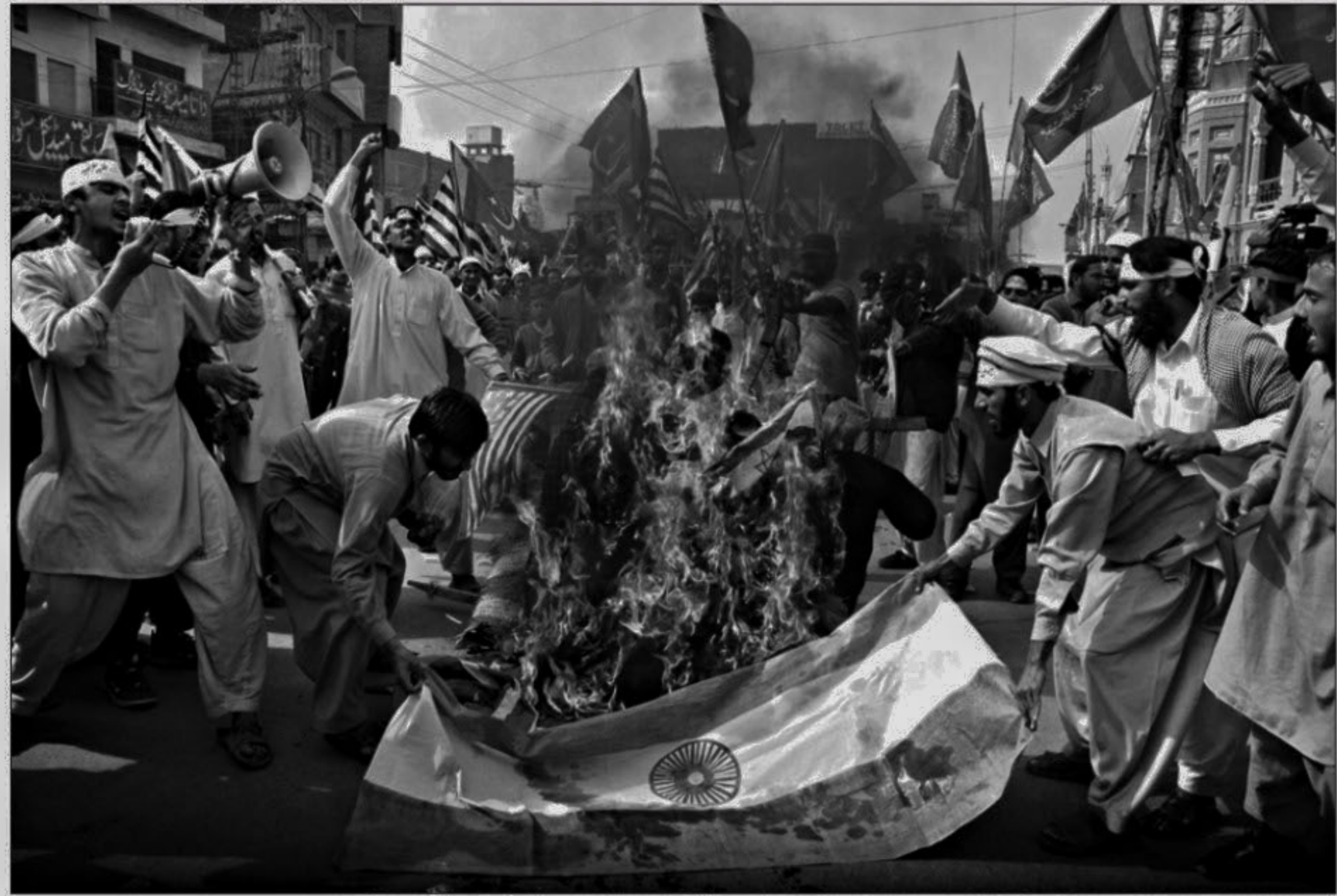
Pakistani activists from Shabab-i-Milli torch an Indian flag during an anti-India protest in Multan yesterday to mark Kashmir Solidarity Day. Thousands of people rallied across Pakistan on Friday to denounce Indian rule in Kashmir, the disputed Muslim-majority Himalayan state divided between the nuclear-armed rivals.

Basit's remarks came a day after it was made known in New Delhi that India had sent a formal proposal to Pakistan for talks between their foreign secretaries and had pledged to pursue the discussions with 'an open and positive mind'.