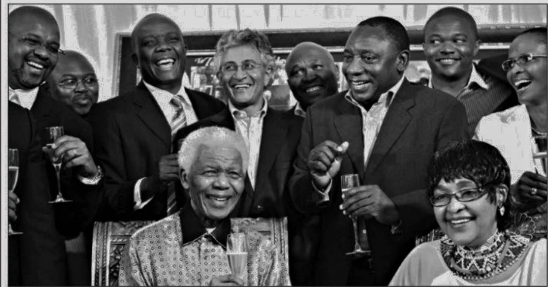
South Africa's first black president Nelson Mandela (1st row L) flanked by his former wife Winnie Madikizela-Mandela celebrates the 20th anniversary of his release from prison with a private dinner party at his home with family, friends and comrades of the liberation struggle on Thursday in Johannesburg.

The parliament could reject the interim EU-US deal at a plenary session next week, after the body's civil rights committee on Thursday pronounced against it.