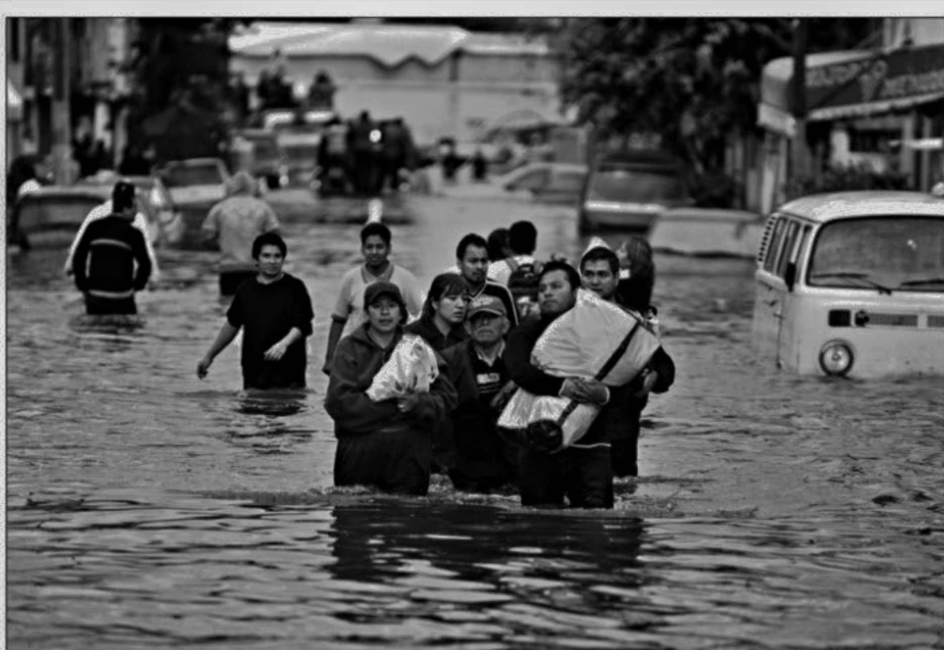
Local residents walk through a flooded street in the Arenal neighbourhood of Mexico City on Thursday. Heavy rains swelled the canal of "Bordo Xochiaca" causing the wall to collapse and flood the city area.