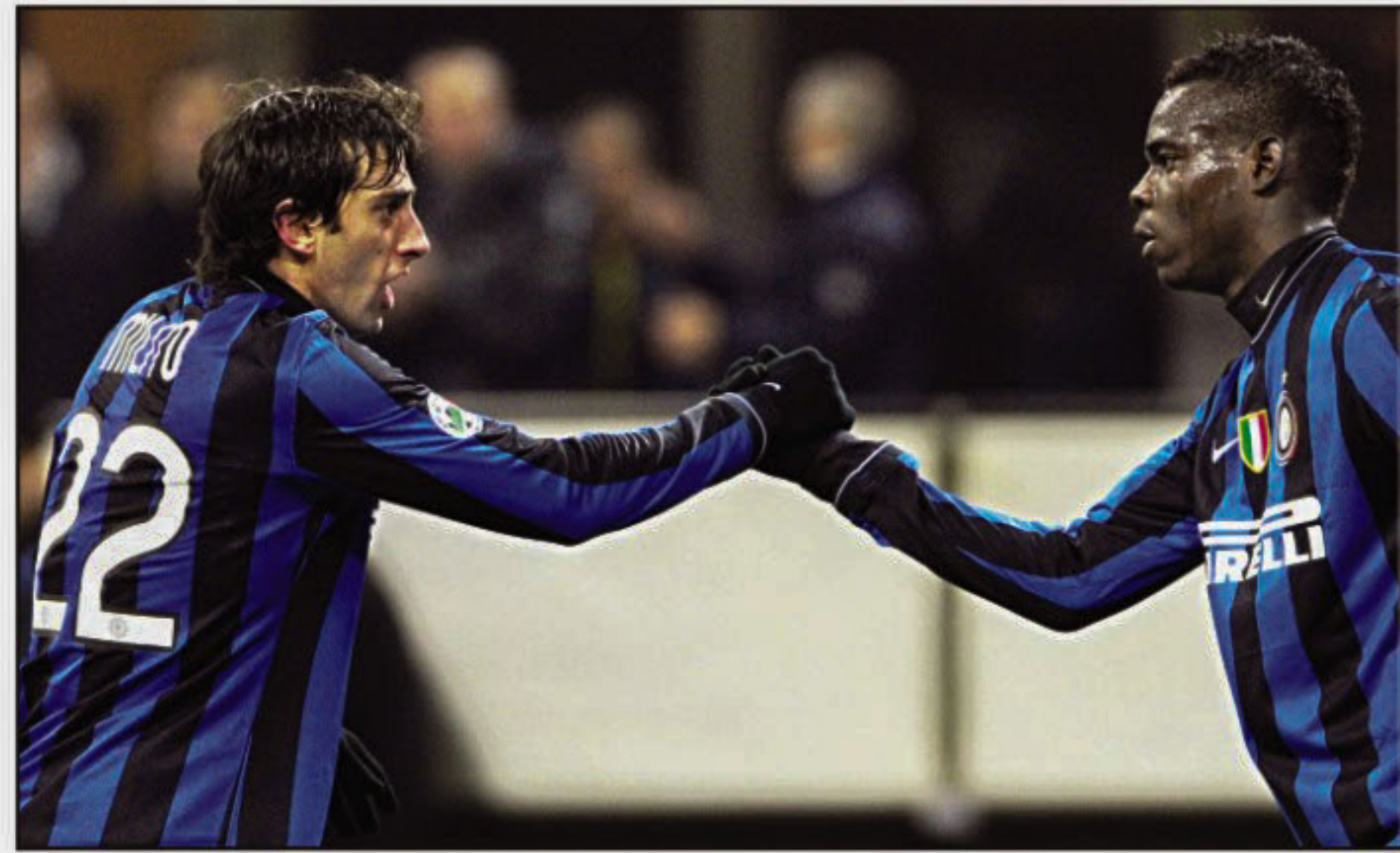
Inter Milan striker Diego Milito (L) celebrates his goal with teammate Mario Balotelli during their Coppa Italia clash against Fiorentina at San Siro on Wednesday.

And they should have wrapped up the victory deep into injury time but Pandev fired wide on the break.