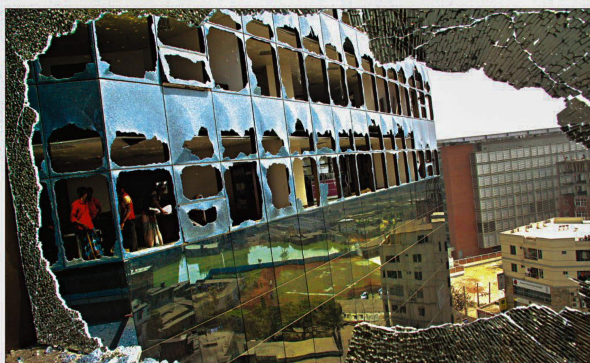
Rajuk eviction team broke the outer glass walls of top four floors of the city's Jamuna Future Park Shopping Complex yesterday. This photo was taken during the drive.