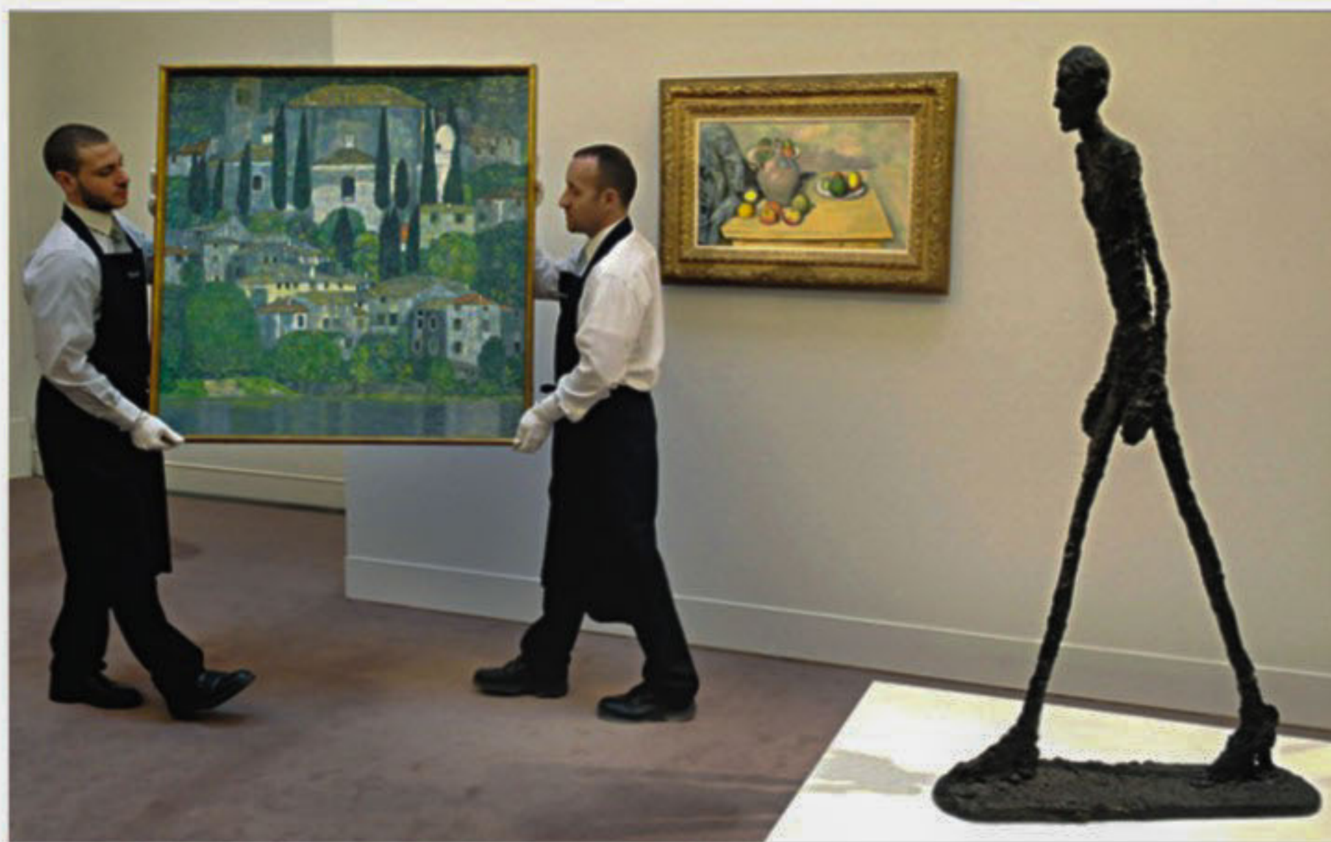
The sculpture (right) by Swiss artist Alberto Giacometti entitled "Walking Man I", at the auction house, in London.

One of Alberto Giacometti's best-loved bronzes, "Walking Man I," has broken the world record price for a work of art at auction, selling to an unidentified telephone bidder for $92.5 million, or $104.3 million with fees, at Sotheby's in London on Wednesday night. The previous record was $104.1 million, paid for a 1905 Picasso, "Boy With a Pipe (The Young Apprentice)," at Sotheby's in New York in 2004.