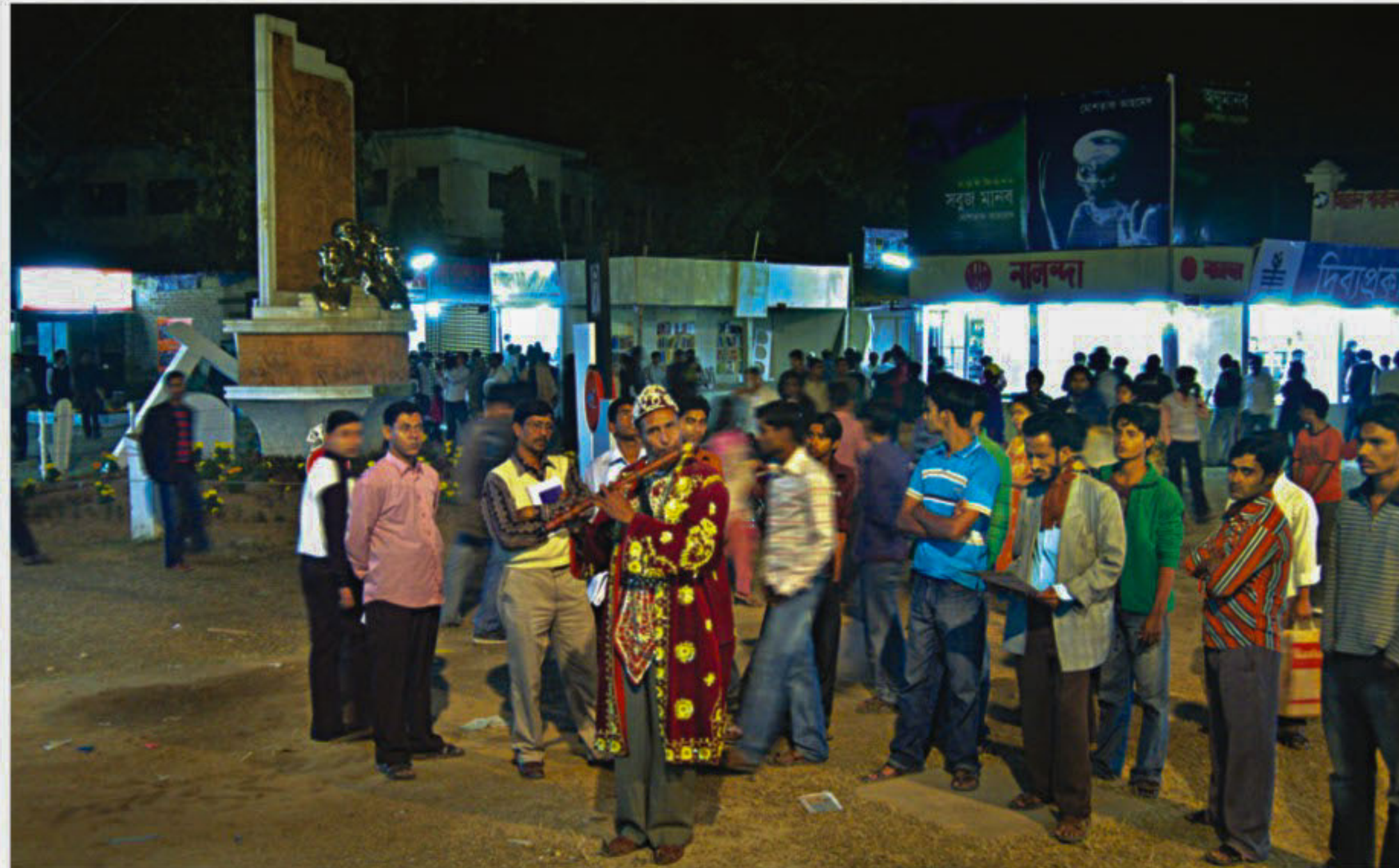
Random attraction at the Boi Mela: a flutist in jatra costume draws public intrigue.