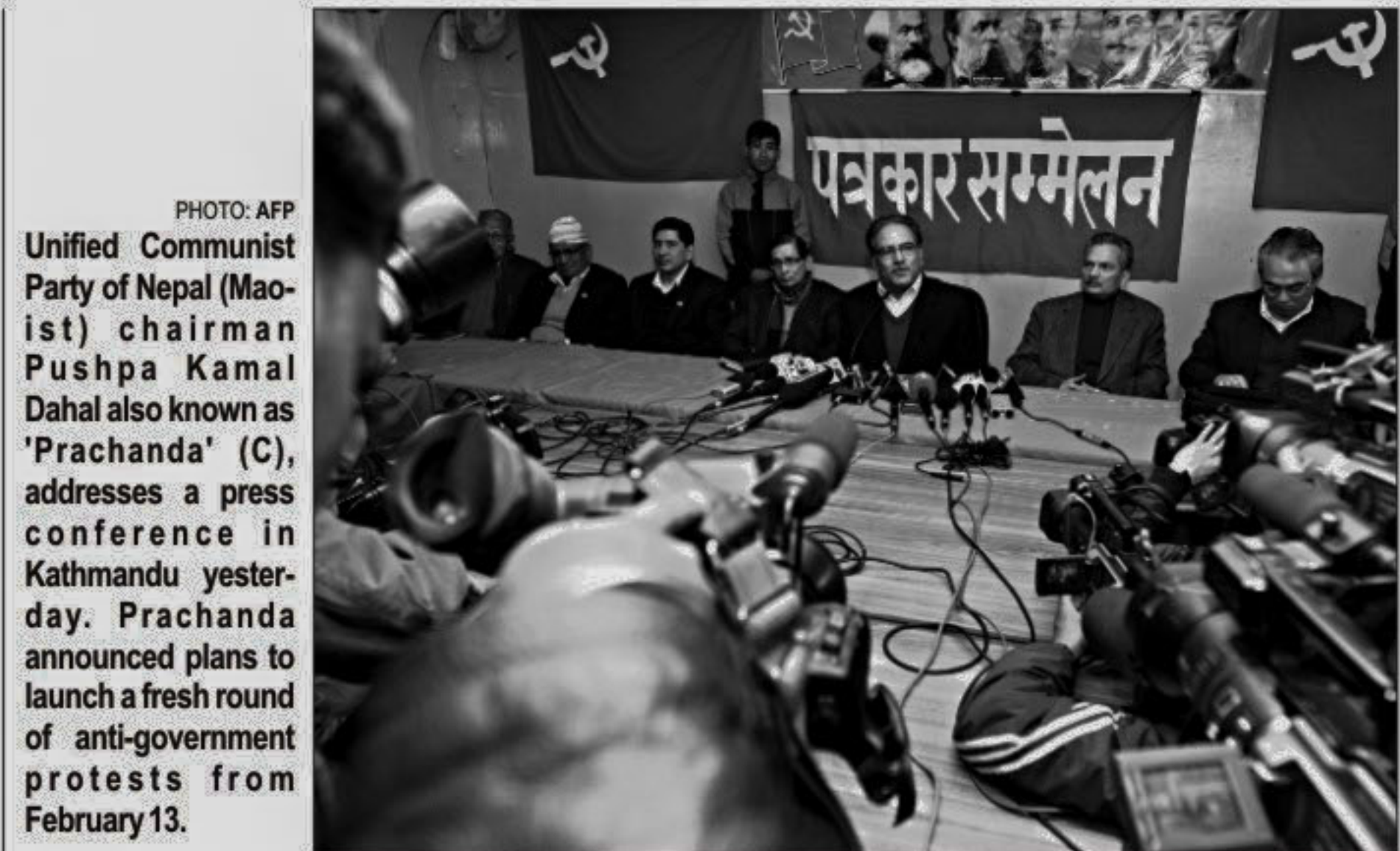
Unified Communist Party of Nepal (Maoist) chairman Pushpa Kamal Dahal also known as 'Prachanda' (C), addresses a press conference in Kathmandu yesterday. Prachanda announced plans to launch a fresh round of anti-government protests from February 13.

Indian Prime Minister Manmohan Singh is understood to have asked his cabinet colleagues to disclose details of their assets and liabilities. In a code of conduct for ministers both at federal and state levels, it has been emphasised that details of the assets should include particulars of all immovable property and the value of shares and debentures, cash holdings and jewellery. The ministers have been advised to snap all connections with the conduct and management of any business in which they were interested before their appointment. The code asked the ministers to divest themselves of all interests in business concerns and their management, which supplies goods or services to the government or to government undertakings. It also asked the ministers to submit annually a declaration regarding their assets and liabilities for the previous financial year.