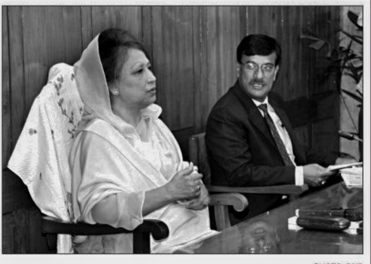
BNP Chairperson and Leader of the Opposition in Parliament Khaleda Zia speaks at her party's parliamentary party meeting at Jatiya Sangsad Bhaban in the city yesterday. (Story on Page 1)