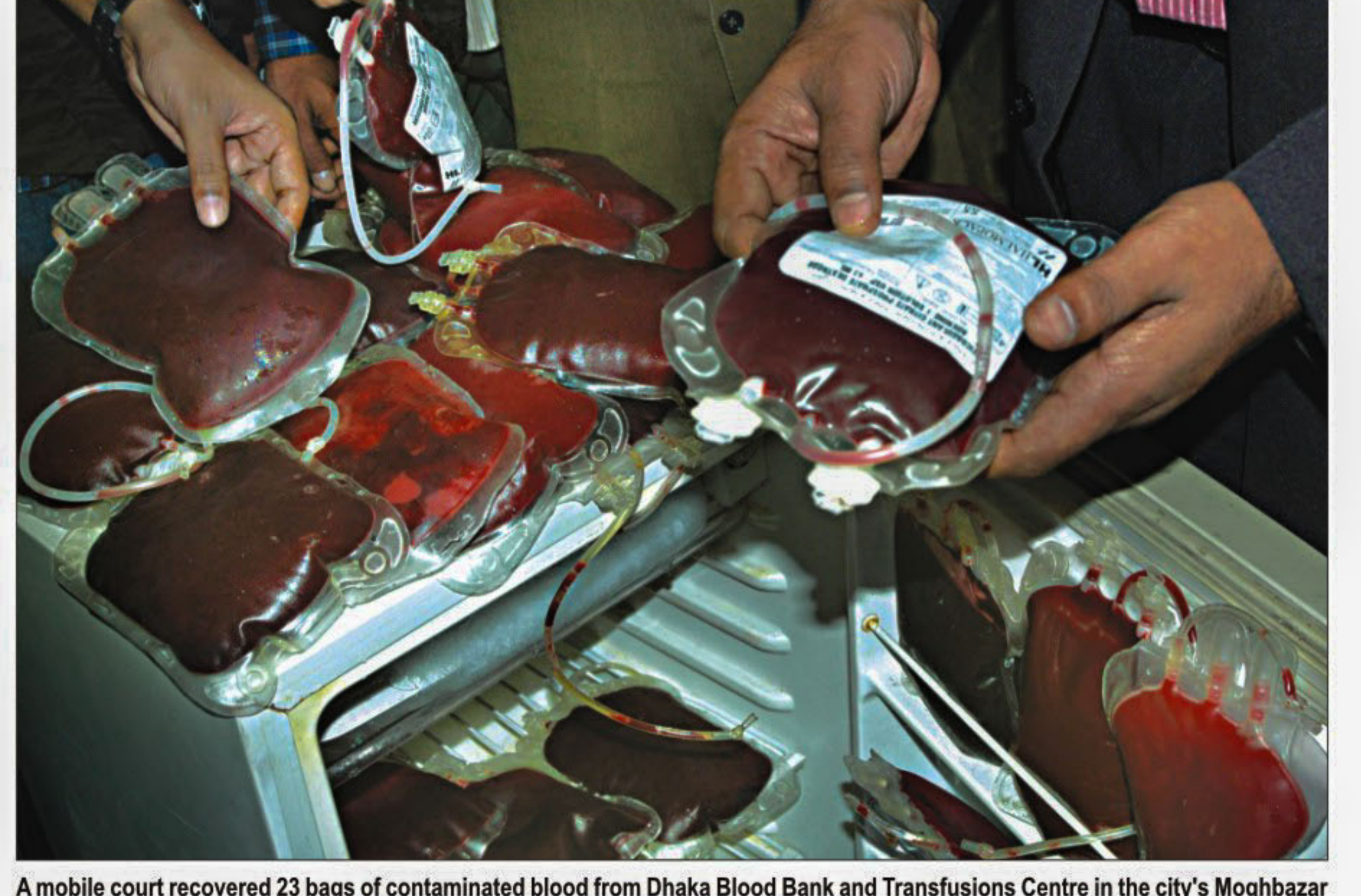
A mobile court recovered 23 bags of contaminated blood from Dhaka Blood Bank and Transfusions Centre in the city's Moghbazar area yesterday.

DU CORRESPONDENT The bookstalls that have already brought new novels of popular writers started drawing attention of the booklovers and visitors at the Amar Ekushey Boid Mela. The presence of booklovers before these stalls was thin while there was not much crowd before other stalls yesterday evening. Booksellers said there were not many people in the fair as violence erupted on Dhaka University campus at noon. In general, there were few buyers in the fair as most of them were visitors. Many school and college-going SEE PAGE 15 COL 6