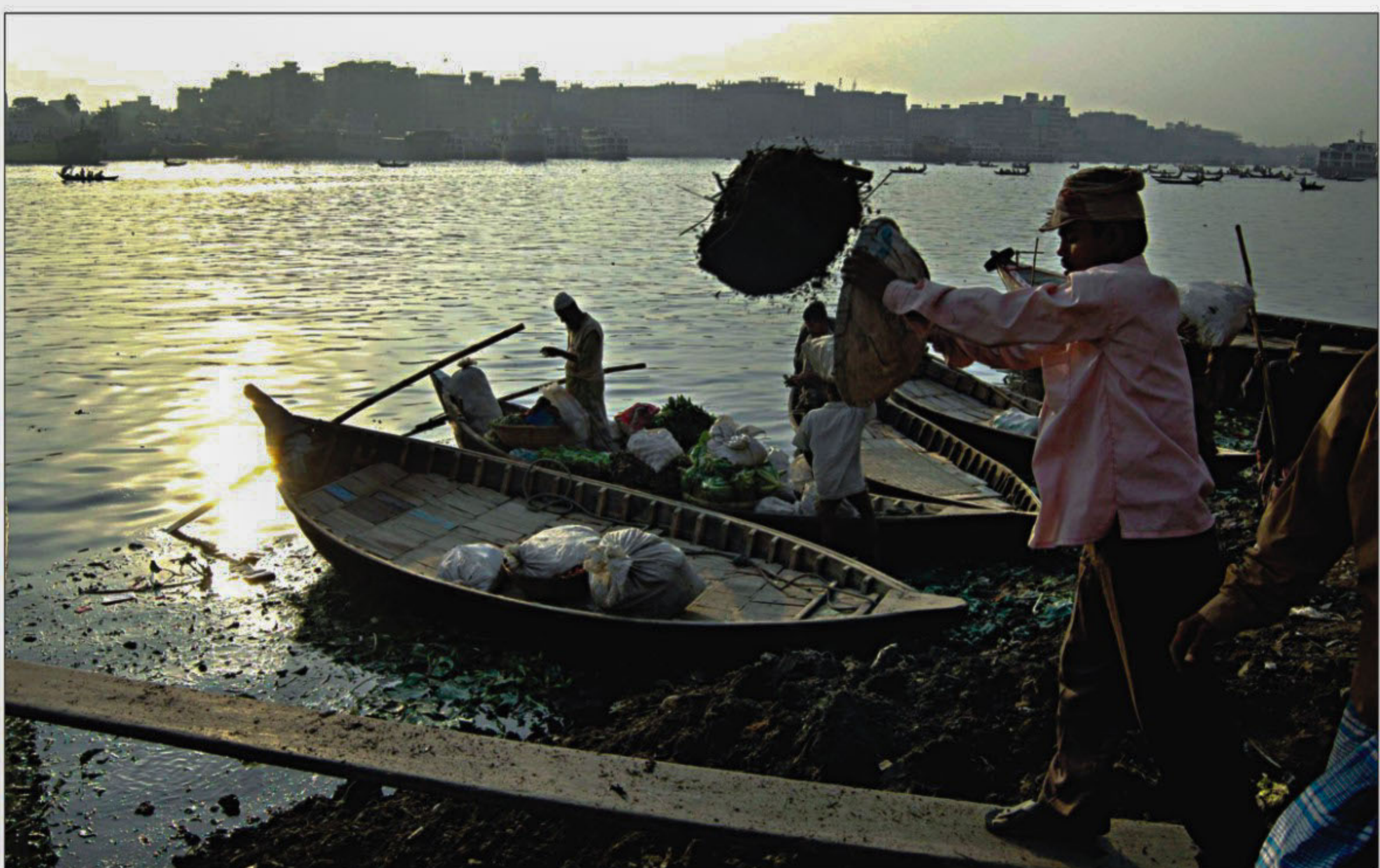
Workers constructing a jetty at Shyambazar of Farashganj in the capital yesterday dump soil into the Buriganga when authorities concerned are conducting a drive to clean up the river. Dumping of garbage in the river goes unabated despite campaigns to save the lifeline of Dhaka.