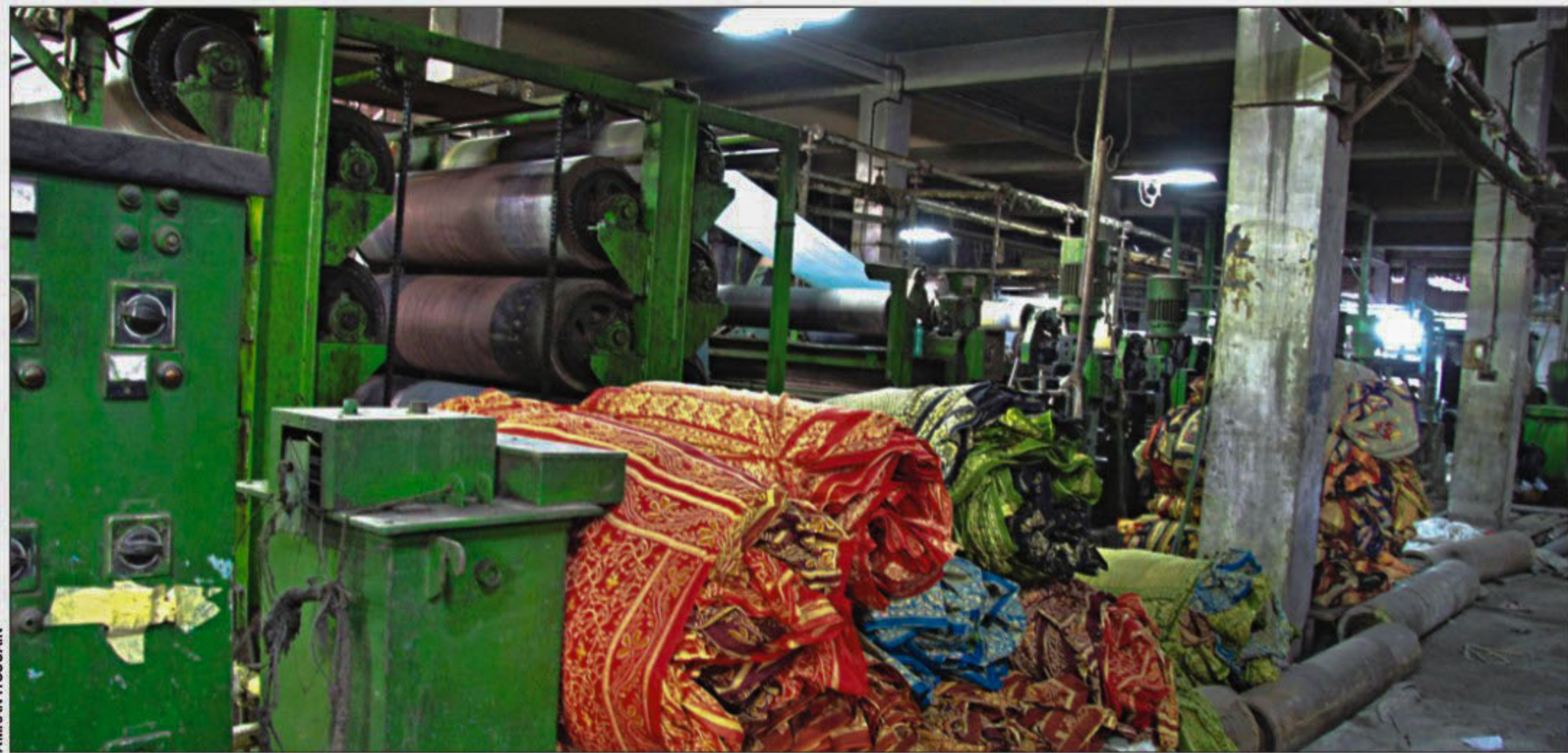
Modern Dyeing & Screen Printing Ltd announced a layoff on Sunday, suspending production due to low gas-pressure and failure to get the government's environment clearance certificate.

In a bid to improve the situation, the government has recently started gas rationing on a rotation basis in textile and readymade