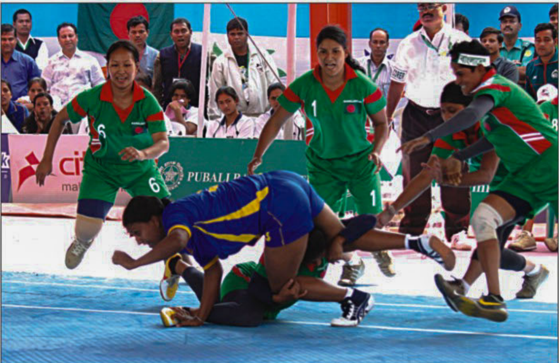
UNITED WE WIN: Bangladesh women kabaddi players run in unison to stop a Sri Lankan player during their SA Games clash at the Kabaddi Stadium yesterday.

The tough-tackling midfielder started this season as a first-team regular but fell out of favour with manager Chris Hughton, who was keen to off-load one of the highest earners at St James' Park.