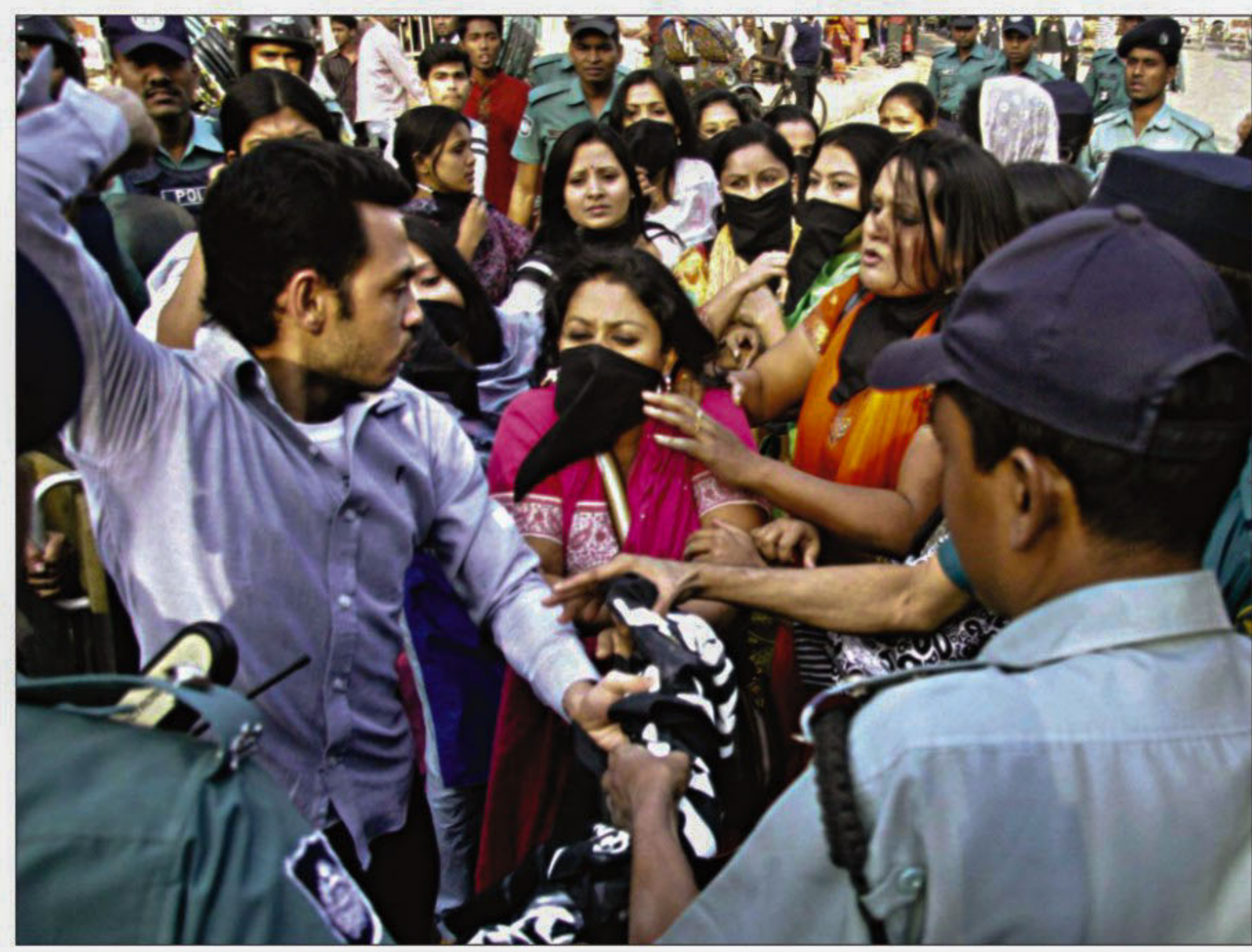
Chhatra League cadres, ignoring the presence of law enforcers, assault women activists of Chhatra Dal on Dhaka University campus for protesting the prime minister's inauguration of Ekushey Book Fair yesterday.