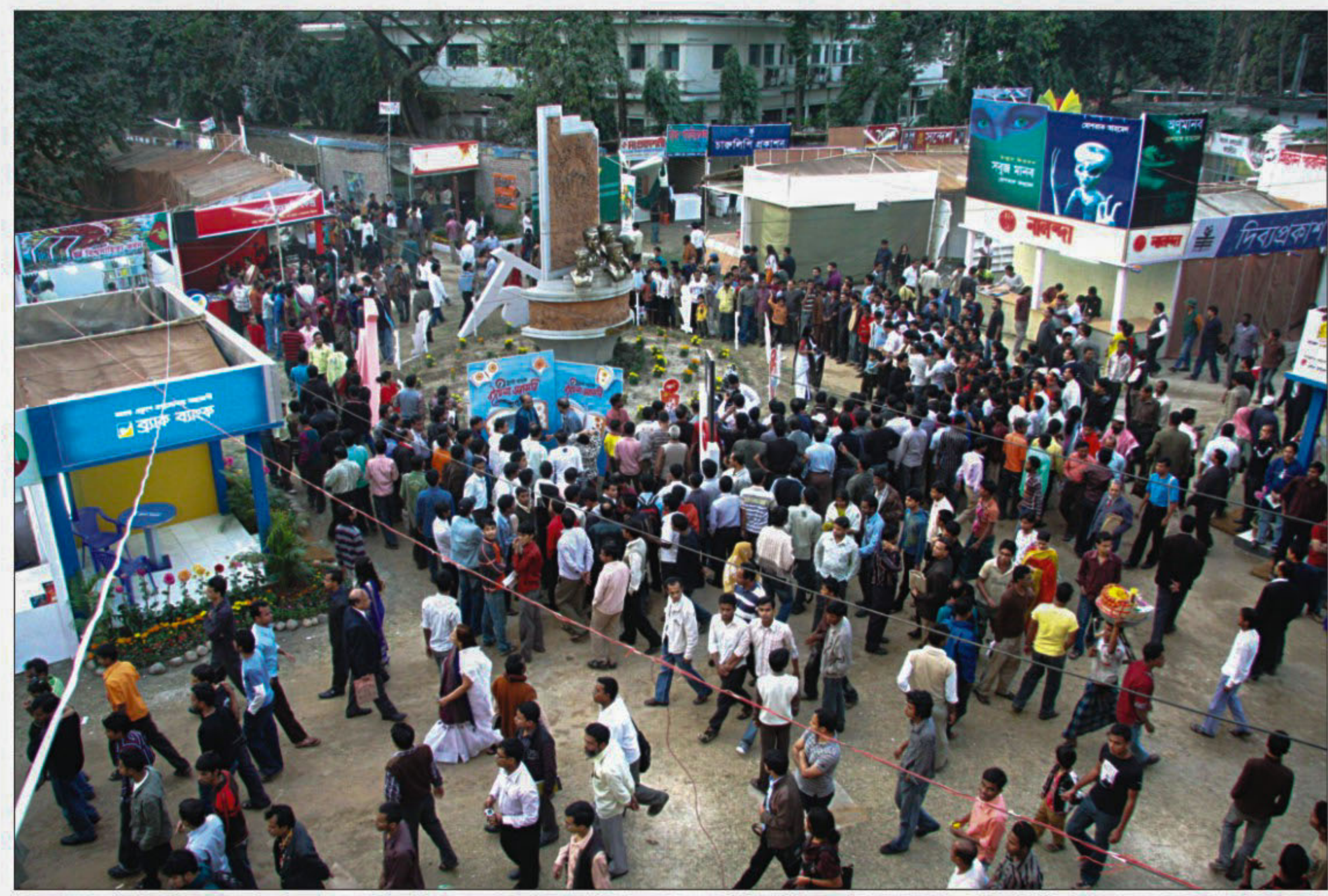
A view of Amar Ekushey Boi Mela venue on Bangla Academy premises yesterday, first day of the book fair.