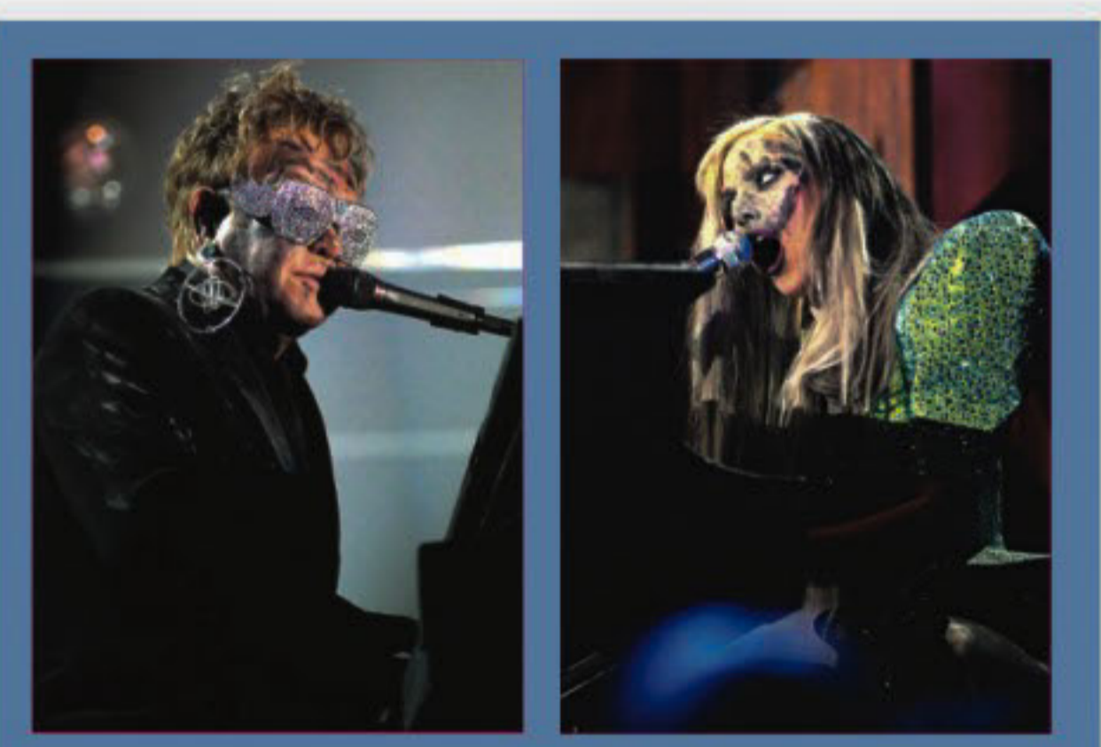
Elton John and Lady Gaga perform a duet.

sparkly shoulder pads -- then welcomed Elton John to the stage for a duelling piano take on Gaga's "Speechless" (and a few bars of the John/Bernie Taupin classic "Your Song"). And, in keeping with the rather flamboyant nature of both artistes, show producers made sure their conjoined piano was topped with severed mannequin arms.