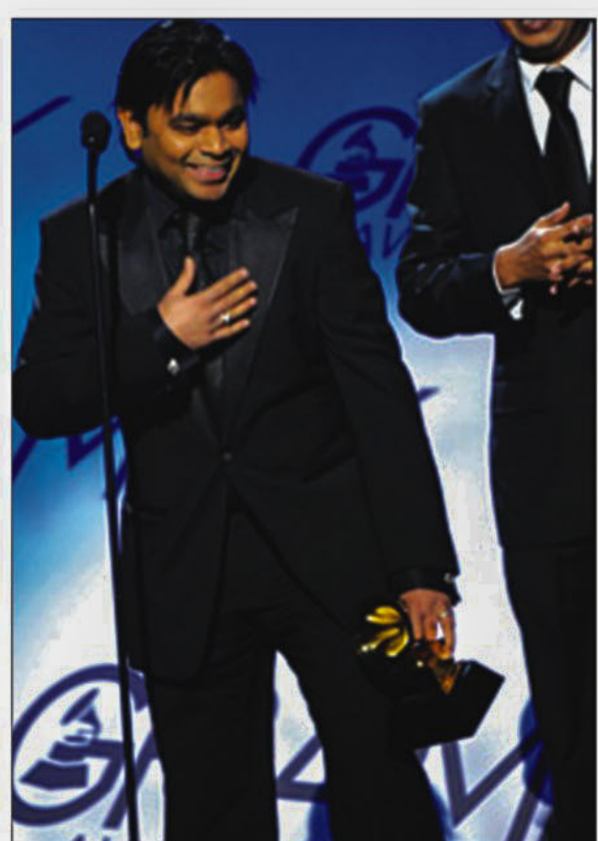
AR Rahman receives his Grammy at the Staples Center in LA.

Indian music maestro AR Rahman, who won two awards at the 52nd Annual Grammy Awards ceremony here, says he never dreamt of winning.