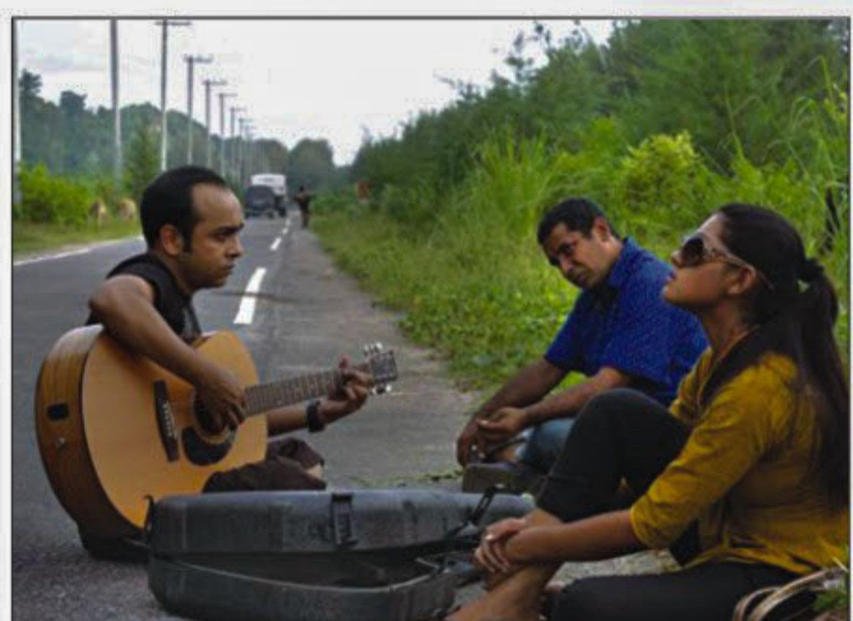
A scene from "Third Person Singular Number".

Most of the cast members are small screen actors including