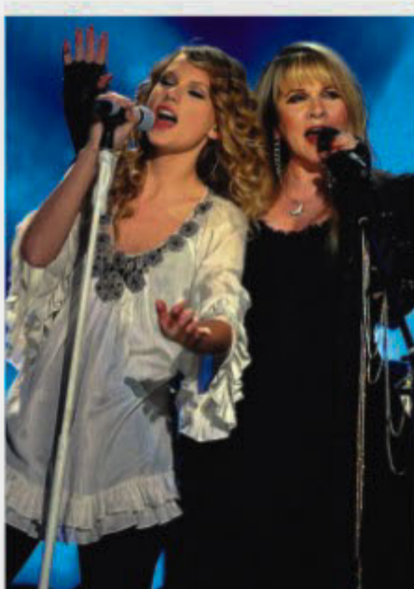
Taylor Swift and Stevie Nicks perform at the Grammys.

But for all the award-accepting merriment, it was the performances that shined brightest on this Grammy night. Or at least they shined the loud-