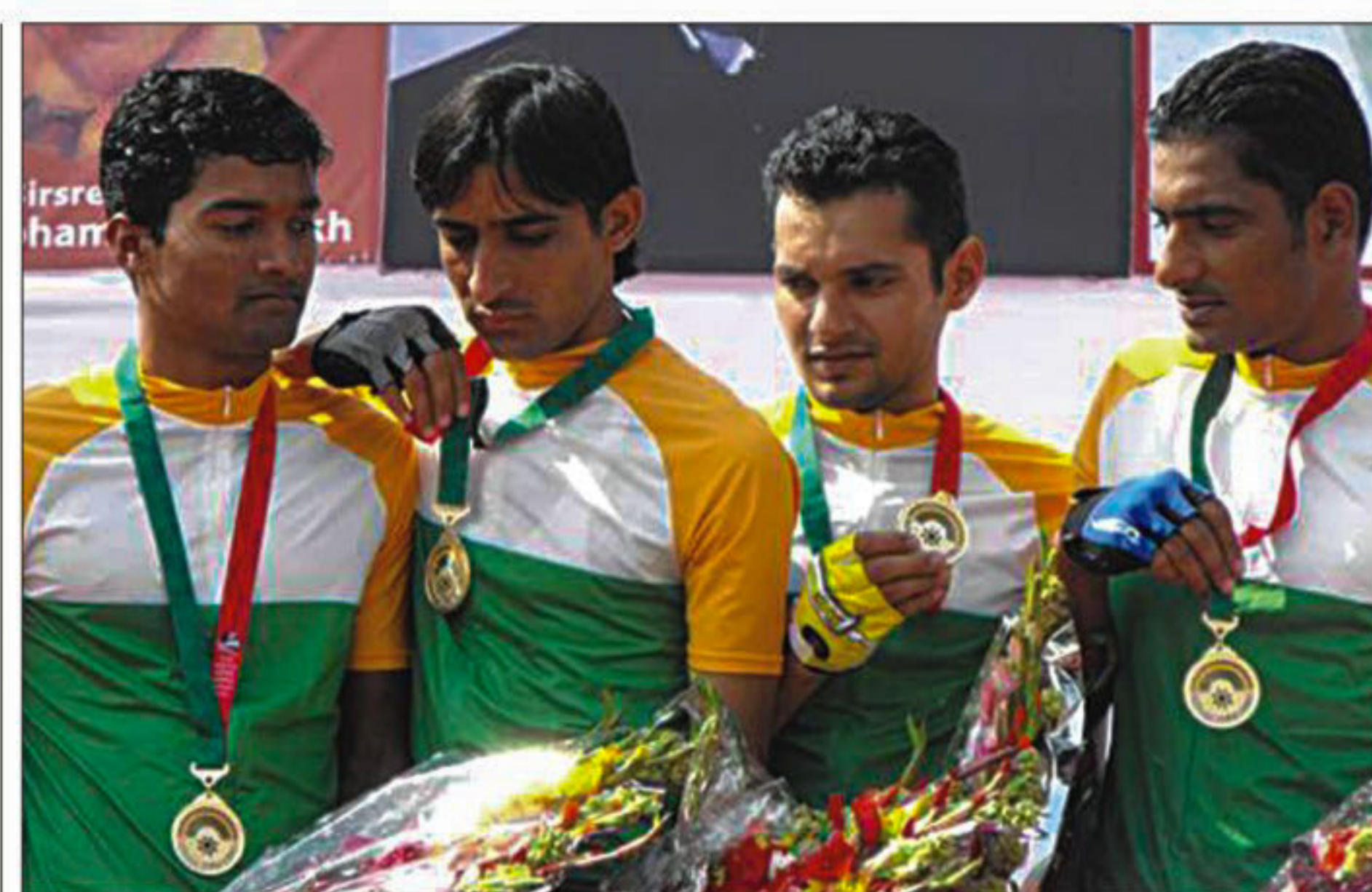
Members of the Indian 80-kilometre road race time trial cycling team show their gold medals at Khulna yesterday.

"Spectacular: Cassano to Florence" read a headline on the front page of Sunday's La Gazzetta Sportiva.