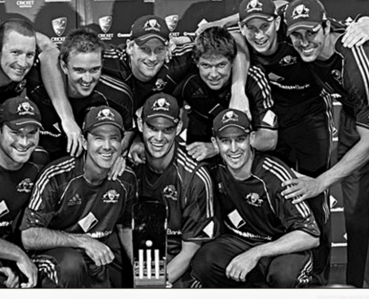
The Australian players pose with the ODI series trophy after beating Pakistan in the fifth and final one-day international in Perth yesterday.