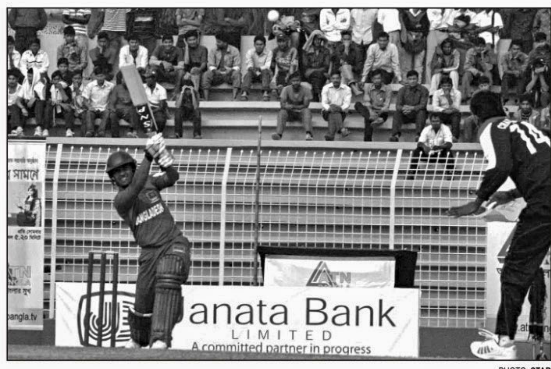
Bangladesh captain Mohammad Mithun hoists one over the Nepal bowler during their T20 match of the SA Games at the Shaheed Kamruzzaman Stadium in Rajshahi yesterday.