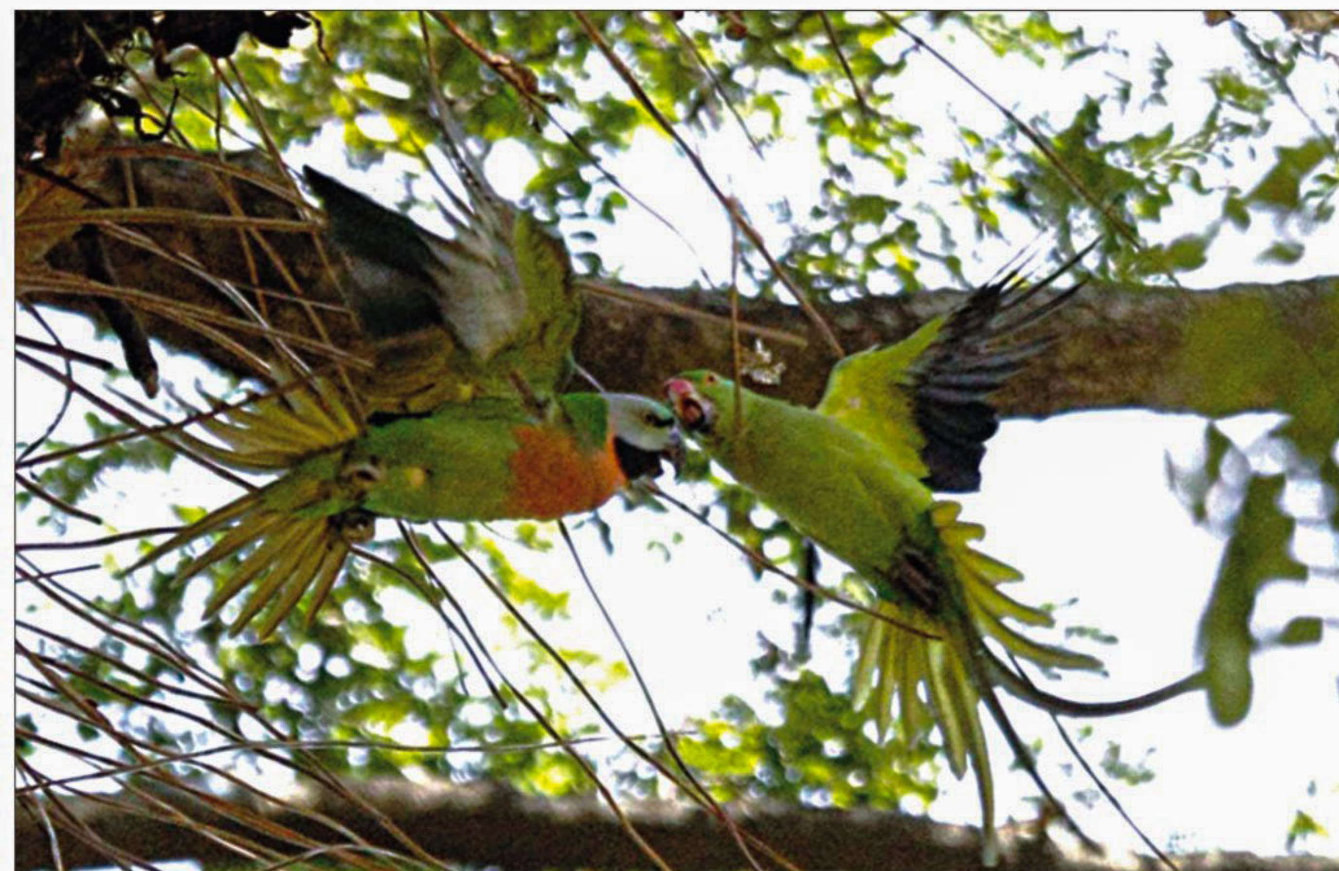
A pair of parrots photographed recently in the port city's CRB area. Hundreds of parrots nest on the branches of age-old rain trees in the area.