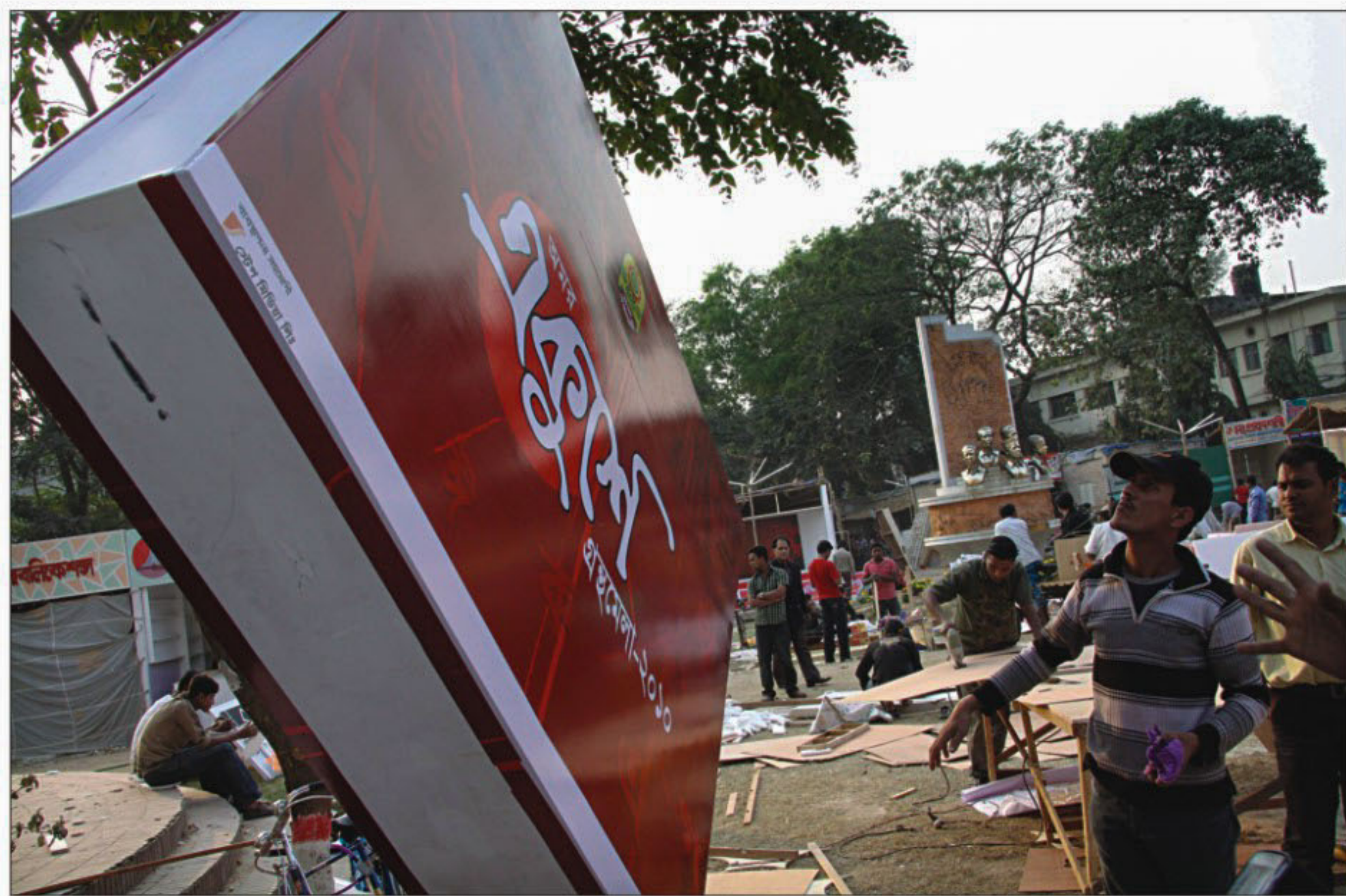
The last-minute preparation continues on the Bangla Academy premises yesterday, day before the inauguration of Ekushey Boi Mela.