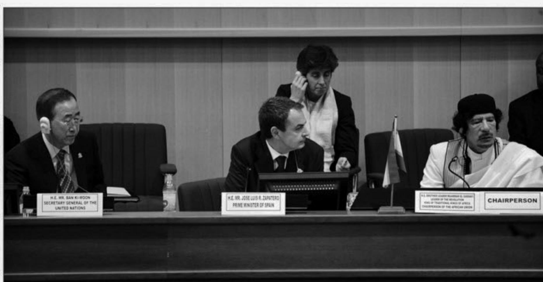
From left: UN Secretary General Ban Ki-moon, Spanish Prime Minister Jose Luis Rodriguez Zapatero, whose country holds the rotating AU presidency, and Libyan leader and outgoing African Union (AU) Chairman Muammar Gaddafi attend the opening session of the three-day AU summit in Addis Ababa. Gaddafi reluctantly handed over the AU presidency to Malawi's President Bingu wa Mutharika.

AFP, Sanaa Clashes broke out overnight between Yemen's forces and northern Shia rebels despite a rebel truce offer, military officials said yesterday, as the government claimed another 24 Huthis killed.