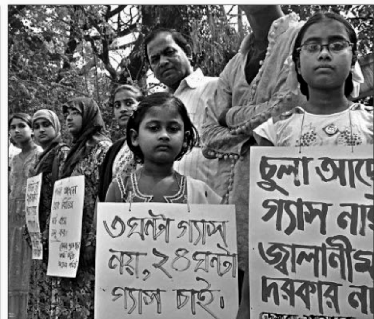
Residents of Demra and Shyampur stage a demonstration in front of the National Press Club in the city yesterday demanding uninterrupted gas supply. (Story on Page 3)

The rest three told the court that they saw no vandalism on the SC premises on November 30 of 2006.