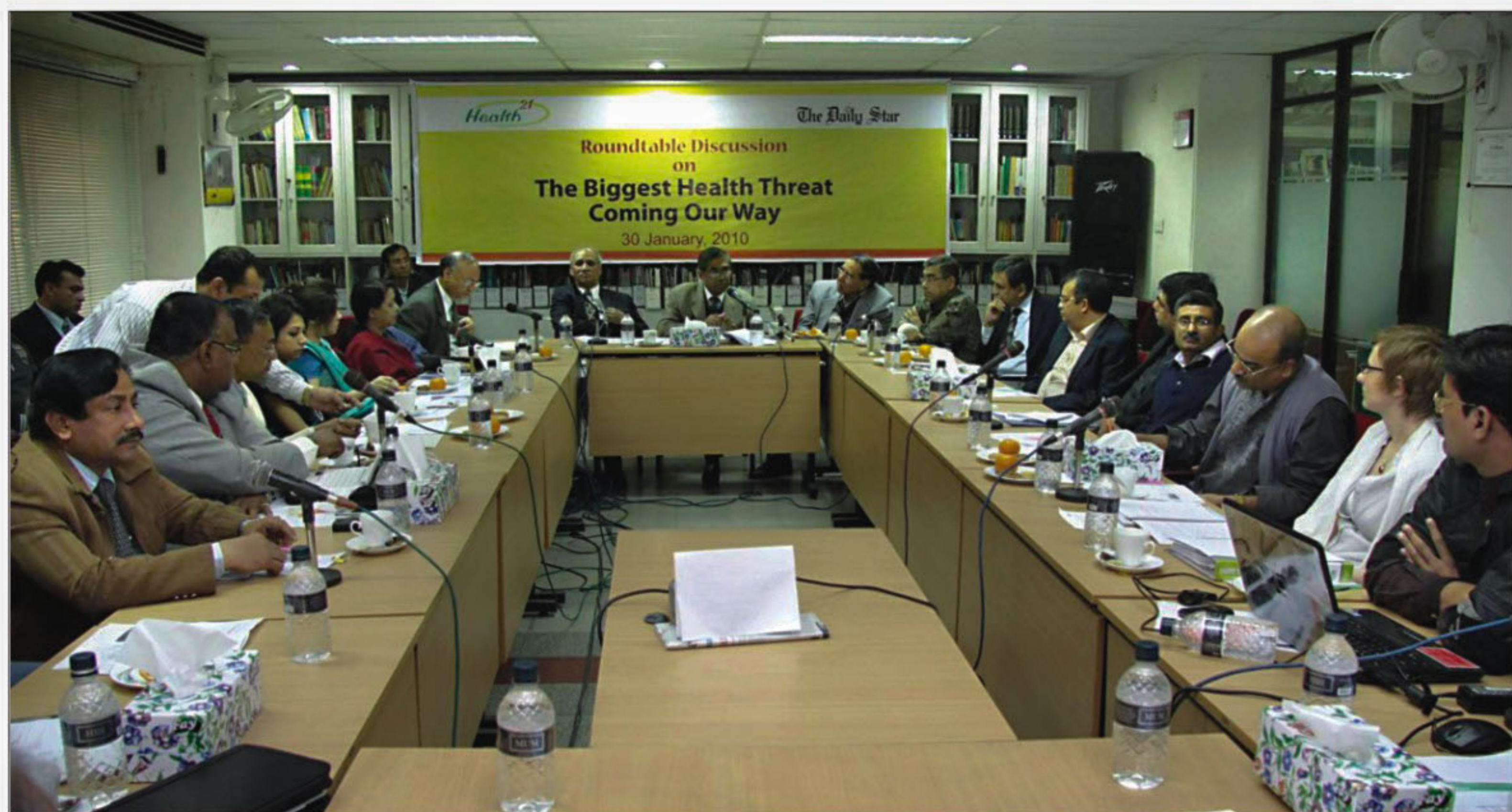
Participants at a roundtable on 'Climate change: The biggest health threat coming our way' jointly organised by The Daily Star and Health 21 at the office of the daily in the city yesterday. (Story on Page 1)