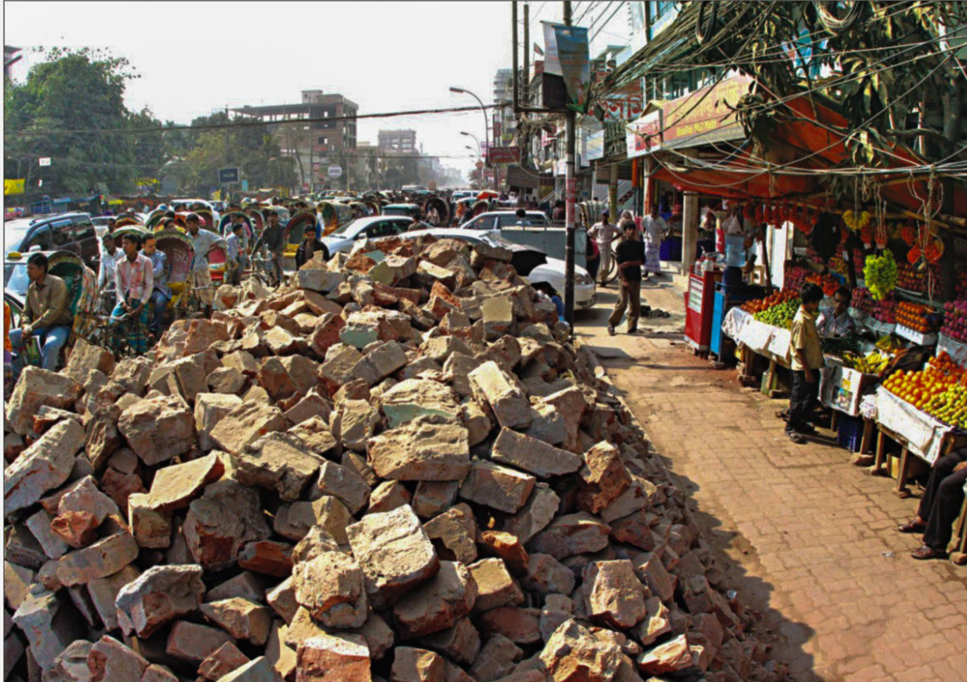
Bricks are stacked up in the middle of Sonargaon Janapath at Uttara in the city, causing massive traffic jam every day. The photo was taken yesterday.

He said most of the journalists are still deprived of getting their salaries as per the provisions of the 7th Wage Board Award due to non-implementation of the hard-earned wage board award. The journalist community does not want to accept businessmen to be the editor of media house having no experience in journalism, he added.