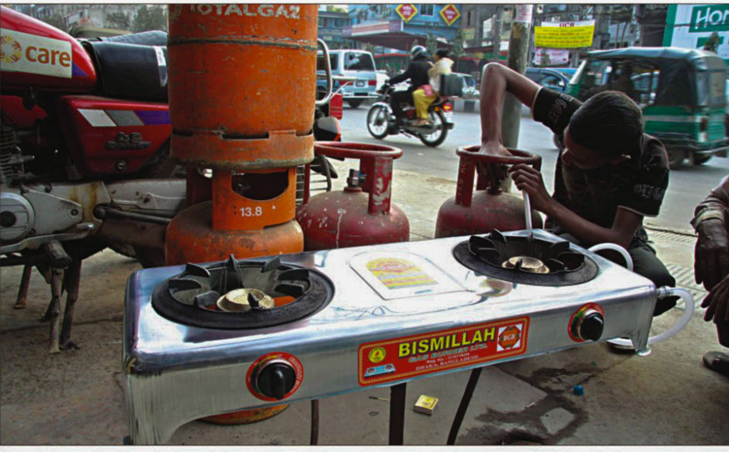
Several shops at Moghbazar in the capital now sell liquefied petroleum gas in cylinders. As parts of Dhaka suffer from acute gas crisis, consumers demand is high these days despite the Tk 1,100 price for one cylinder of gas.