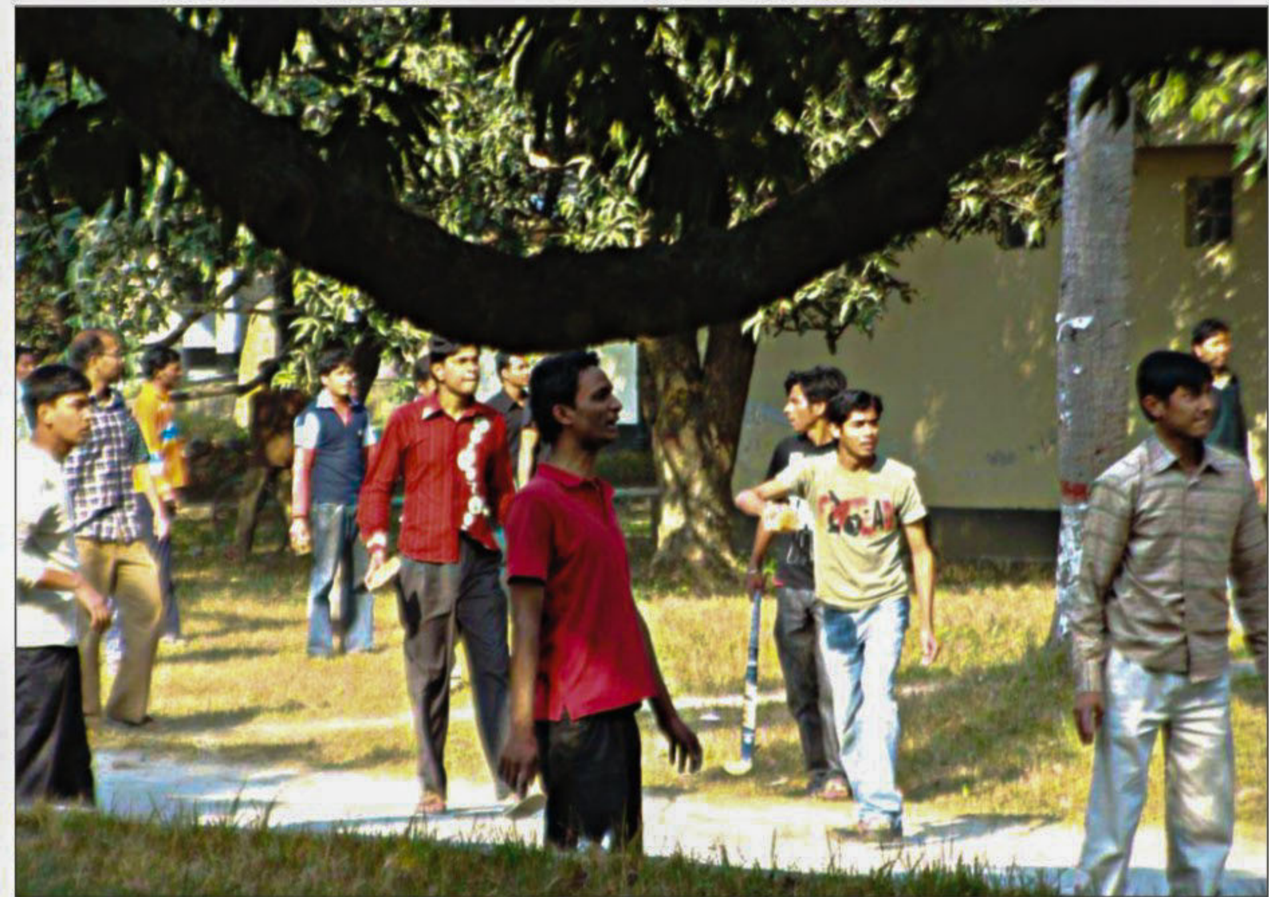
Ruet students clash with police and bus workers, not in frame, on campus yesterday.

The prosecution in the case said the accused were locked in a land dispute with Parvin Akhtar, wife of Tota Miah, at Paikura in Chunarughat upazila of Habiganj on January 31, 2007.