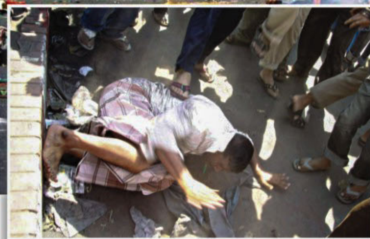
Burnt down shops of hawkers in the port city's Station Road area. Inset, traders beat up a man suspecting him to be a hawker during the violent clash that left some 22 people injured yesterday.