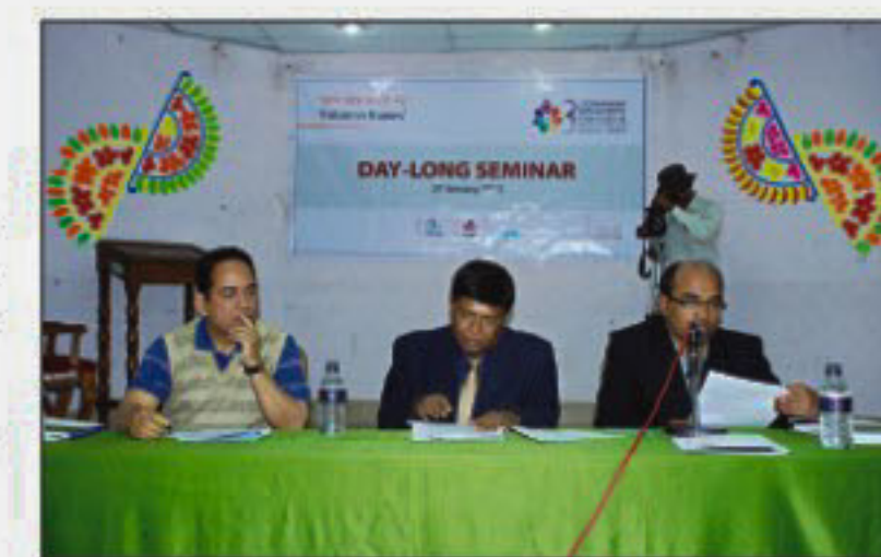
Discussants at a seminar.