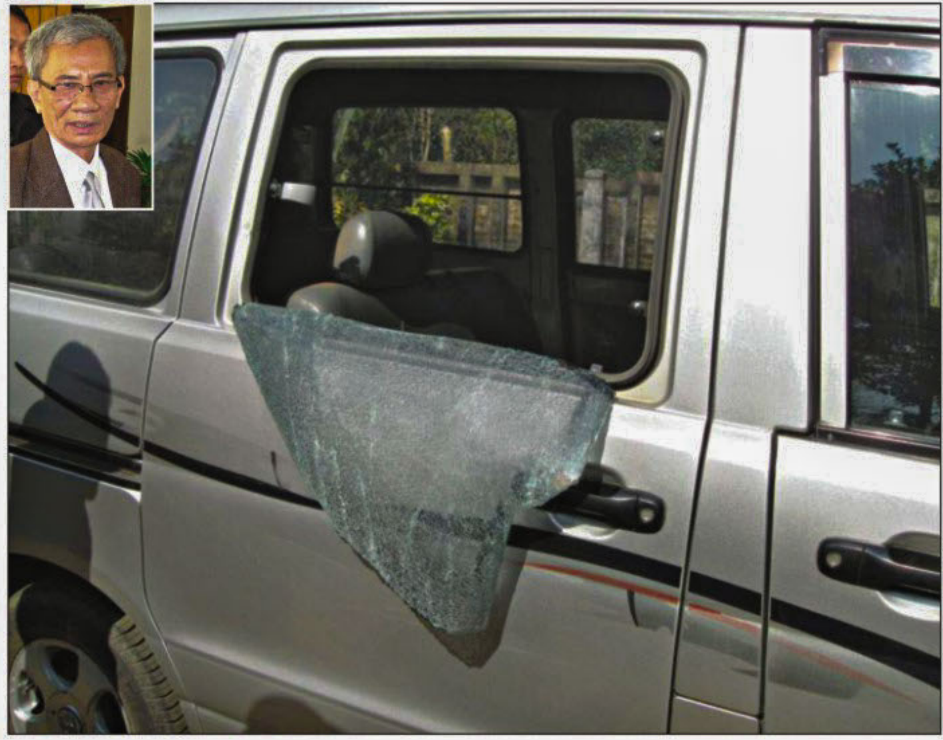
The vehicle carrying Parbatya Chhattagram Jana Sanghati Samity President Santu Larma, inset, gets damaged in an attack by criminals at Lemurchhari in Mohalchhari under Khagrachhari district yesterday.

Rangamati to Kharachhari town to attend the Land Commission meeting.