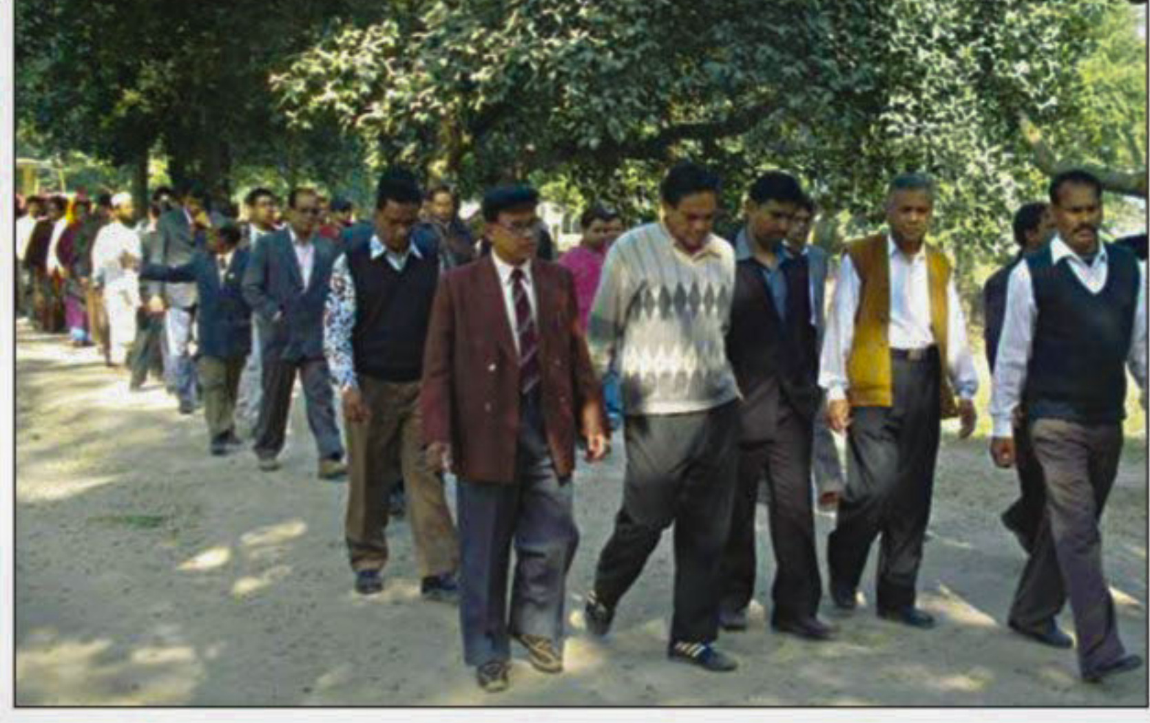
The principal's room at Dinajpur Government College lies ransacked as activists of Bangladesh Chhatra League go on rampage yesterday, right, teachers and general students of the college bring out a procession protesting the incident.