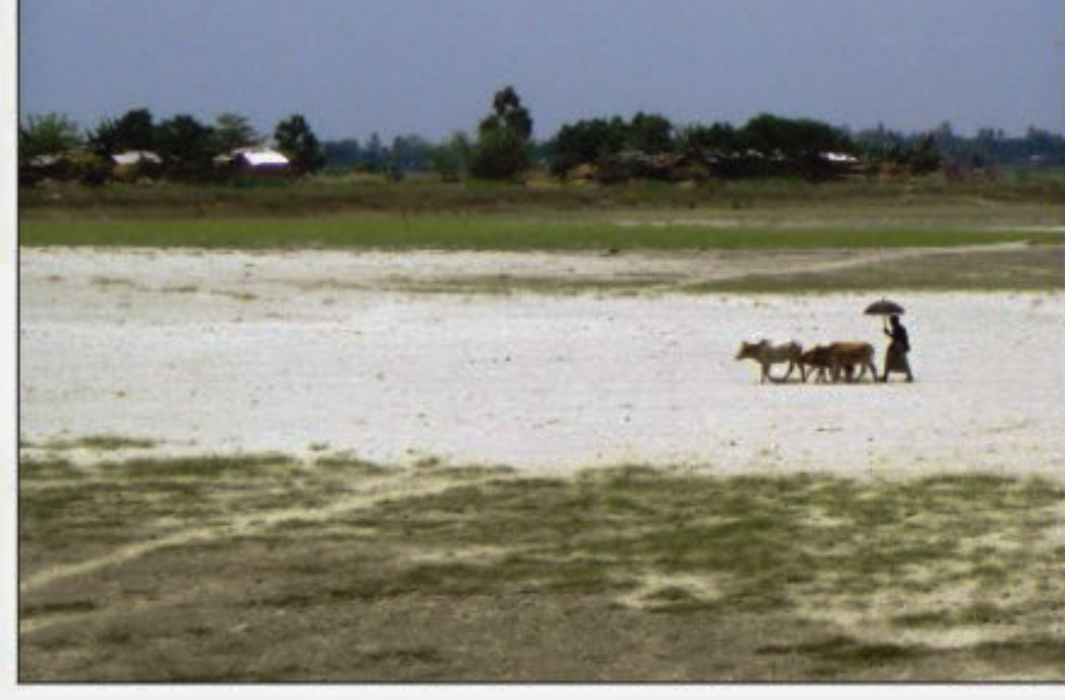
A scene from the documentary.

"Ruddho Koishore" was previously screened at the 4th International Film Festival on Water 2009 in Bangalore, India (as the opening film); 6th Kolkata Short Film Festival 2009, India; Traveling Festival of Karnataka Chalchitra Academy 2009-10, India (to be shown in 30 districts); 3rd Bangladesh Documentary Festival 2009 in Dhaka (as one of the closing films); National Premiere in "Voices of Adolescents" 2008, Dhaka; Special Session of Documentaries on Marginalised Communities 2009, Dhaka and Youth Festival 2008, Dhaka.