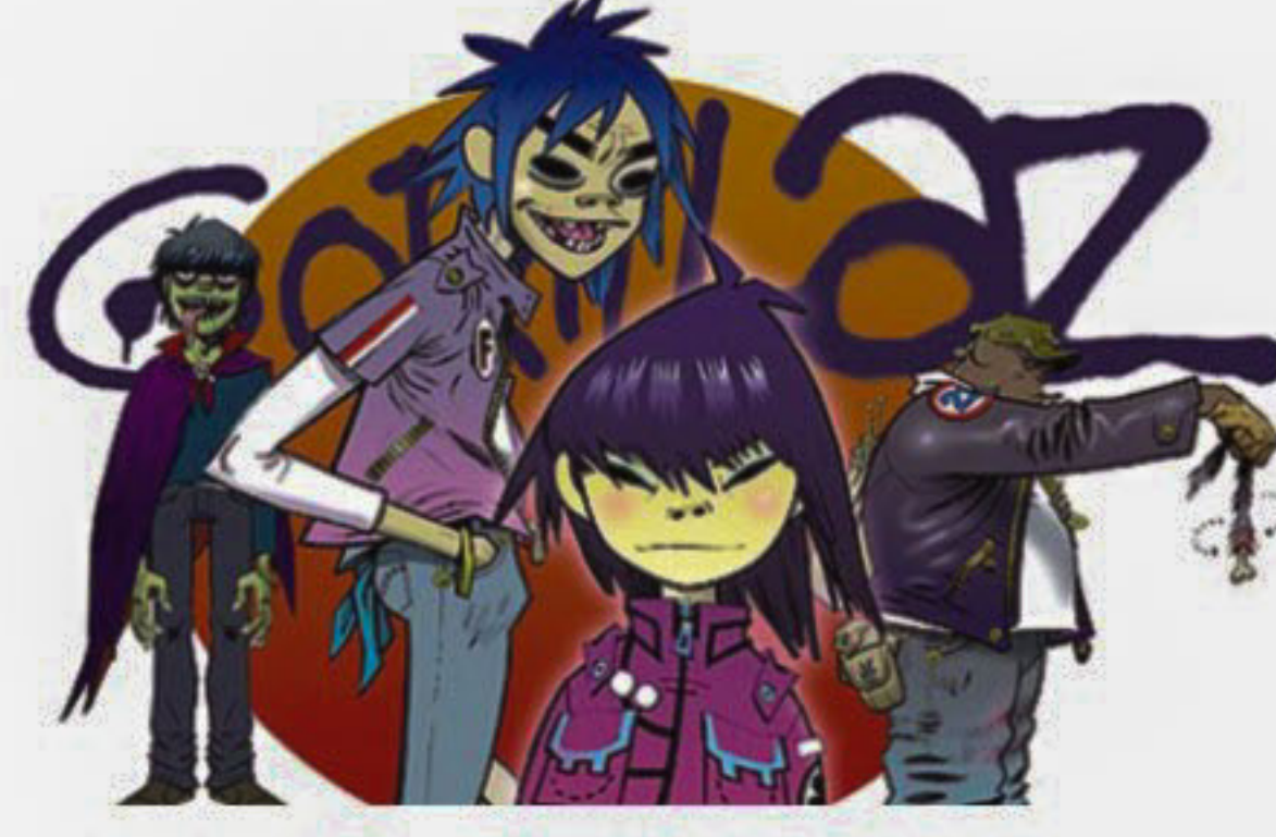
Gorillaz in our midst ... the cartoon pop crew will return in March.