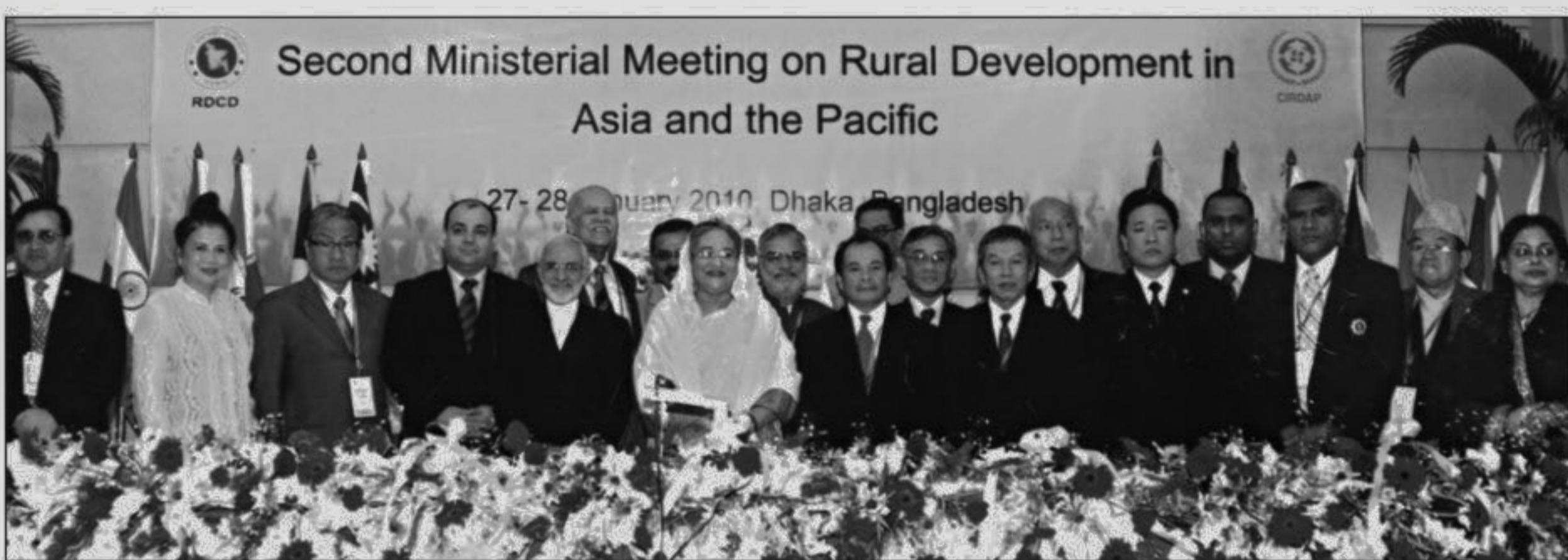
Representatives of Cirdap countries pose for photograph with Prime Minister Sheikh Hasina at the second Cirdap ministerial meeting in the city yesterday.

Hasina said this while inaugurating the 2nd ministerial meeting of Cirdap on 'Rural Development in Asia and the Pacific' organised by LGRD and Cooperatives Ministry in collaboration with the Centre on Integrated Rural Development for Asia and the Pacific (Cirdap) at a city hotel.