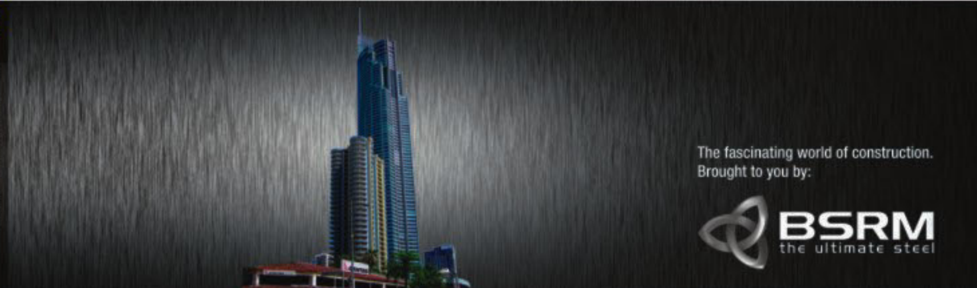
The fascinating world of construction. Brought to you by:

Q1 (meaning Queensland Number One) is a supertall skyscraper located in Surfers Paradise, on the Gold Coast. At 322.5 meters, it is the world's tallest residential tower and the tallest building in Australia and the Southern Hemisphere.