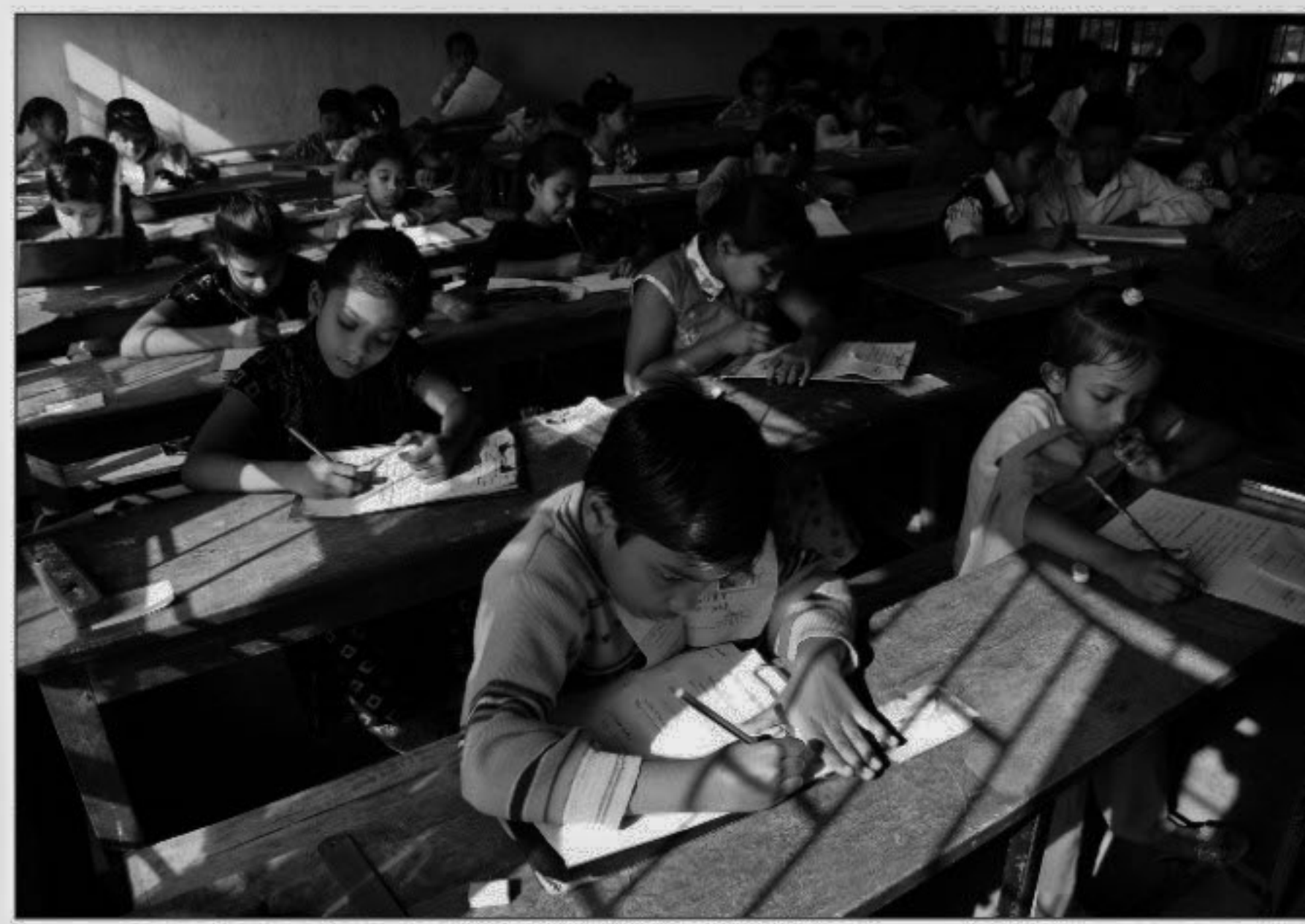
NOOR ALAM / DRINKNEWS

We expect their regular participation, and not a short lived one. Shafiqul Islam, NY