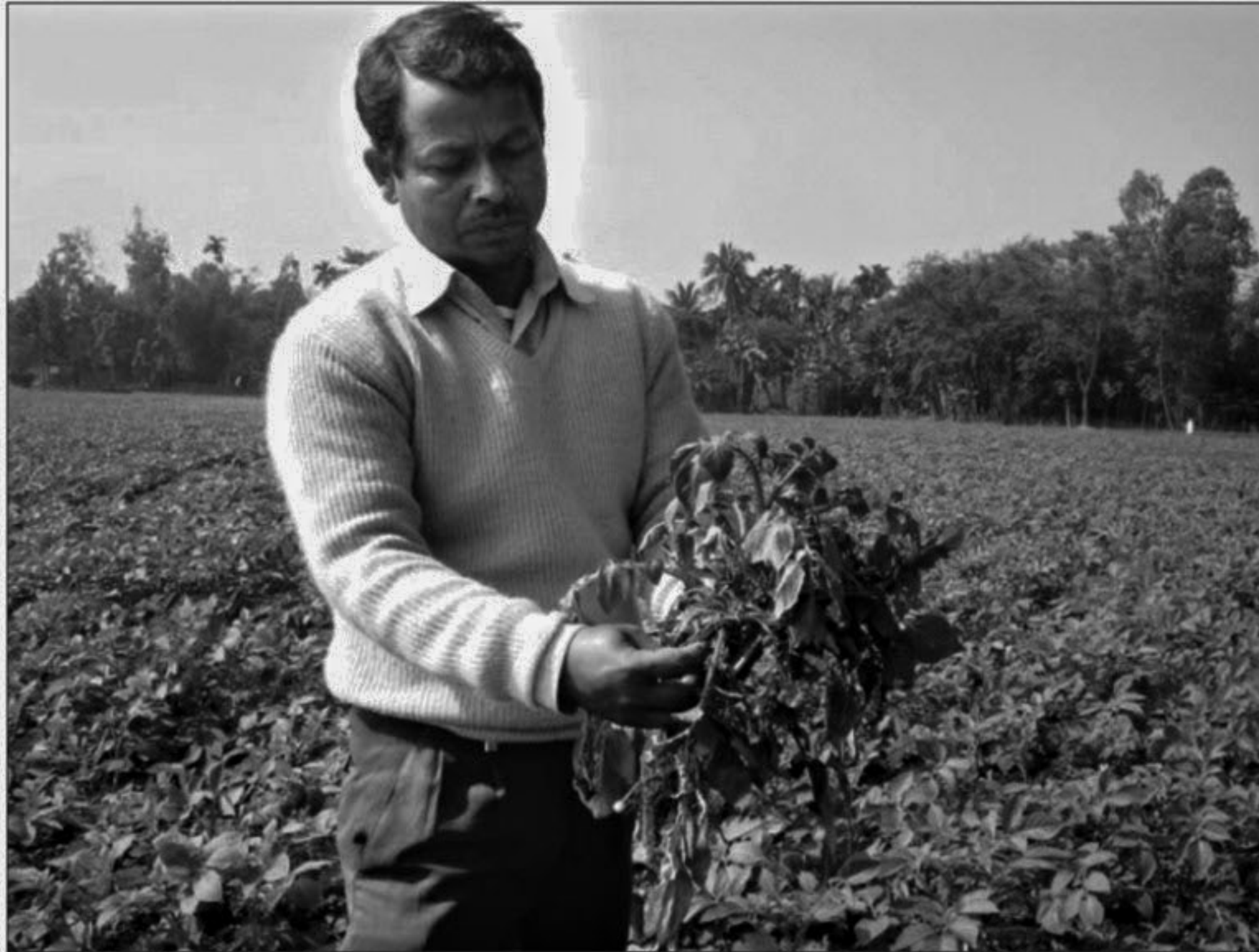
A farmer picks up a dead potato plant from his field in Pirgachha upazila, Rangpur. Potato plants on about 500 bighas of land in the district died prematurely due to the use of low-quality seeds.

However, Quader thinks it might be a problem with soil or weather. Dutch experts are expected to arrive in the area next month to examine the potato fields, said to be affected, added Agro Concern's boss.