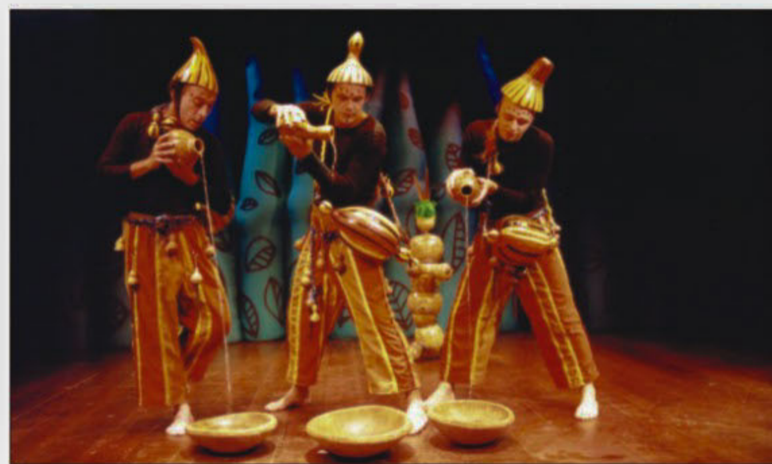
'Animals of Brazil' uses inflatable puppets, great music and choreography to depict the amazing biodiversity of Brazil.