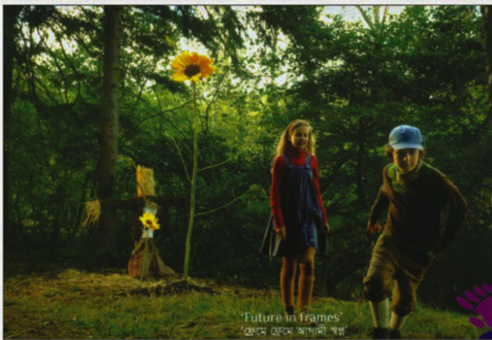
Over 240 children's films from 50 countries are being screened at the festival.