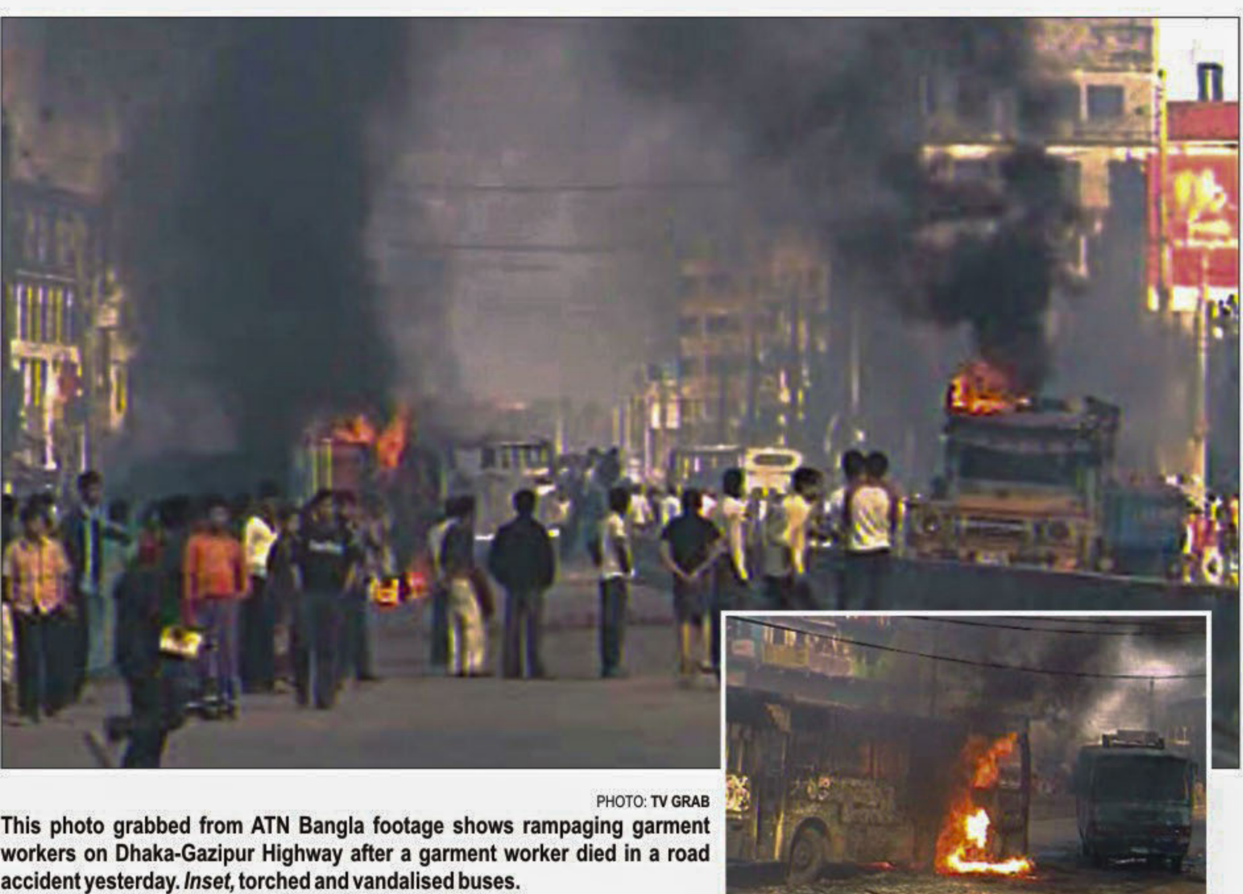
This photo grabbed from ATN Bangla footage shows rampaging garment workers on Dhaka-Gazipur Highway after a garment worker died in a road accident yesterday. Inset, torched and vandalised buses.