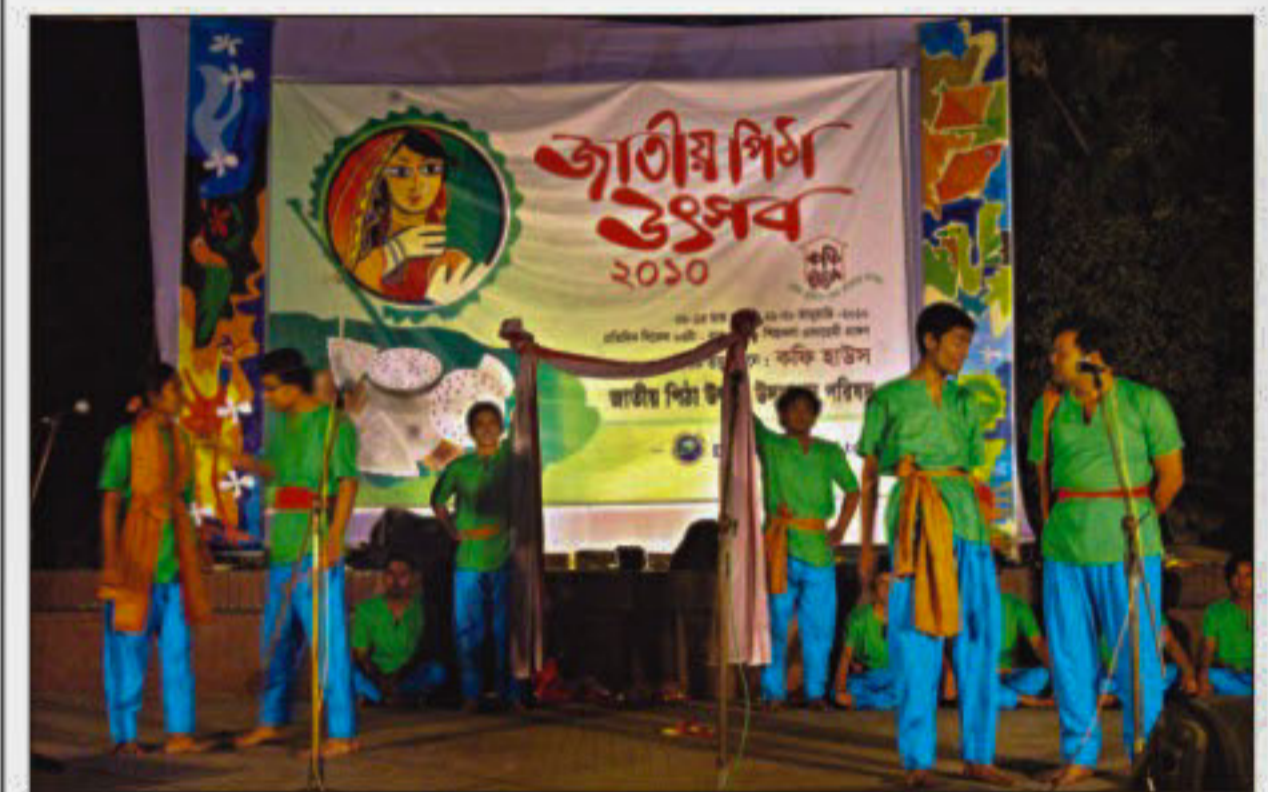
Apart from delectable pitha , the festival also includes cultural programme (top).

"Apart from Dhaka participants, food connoisseurs from