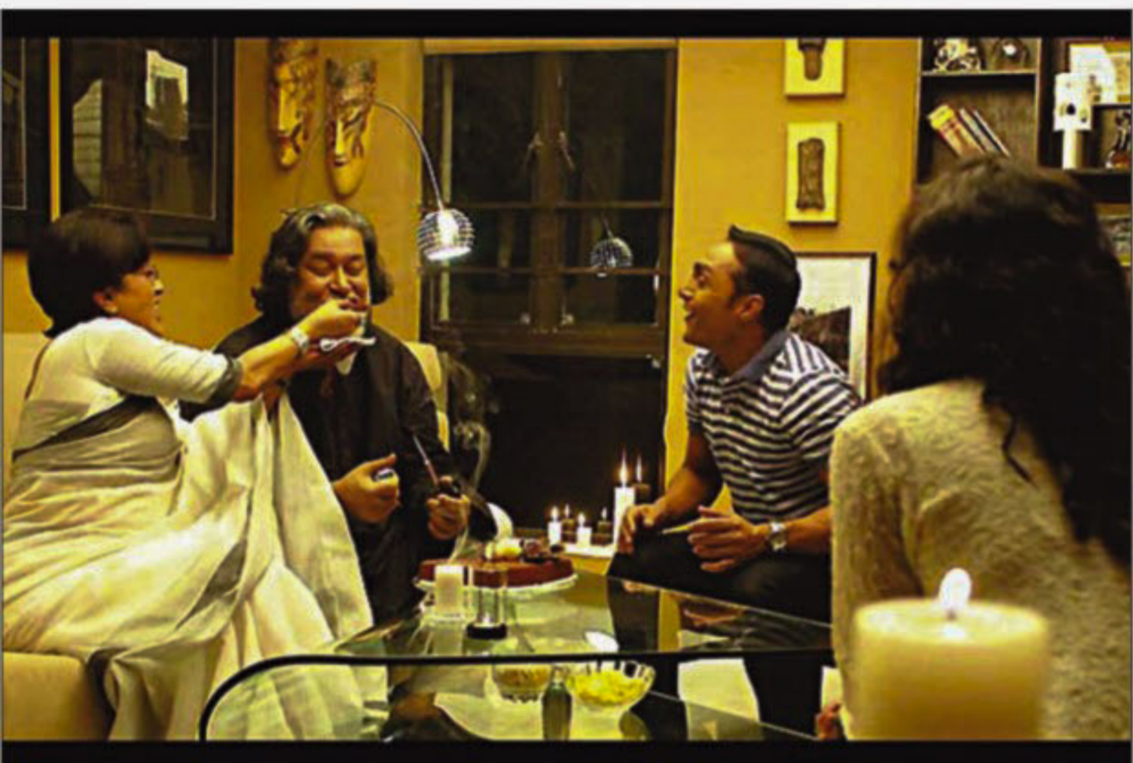
A scene from the Bengali feature film "Antaheen".