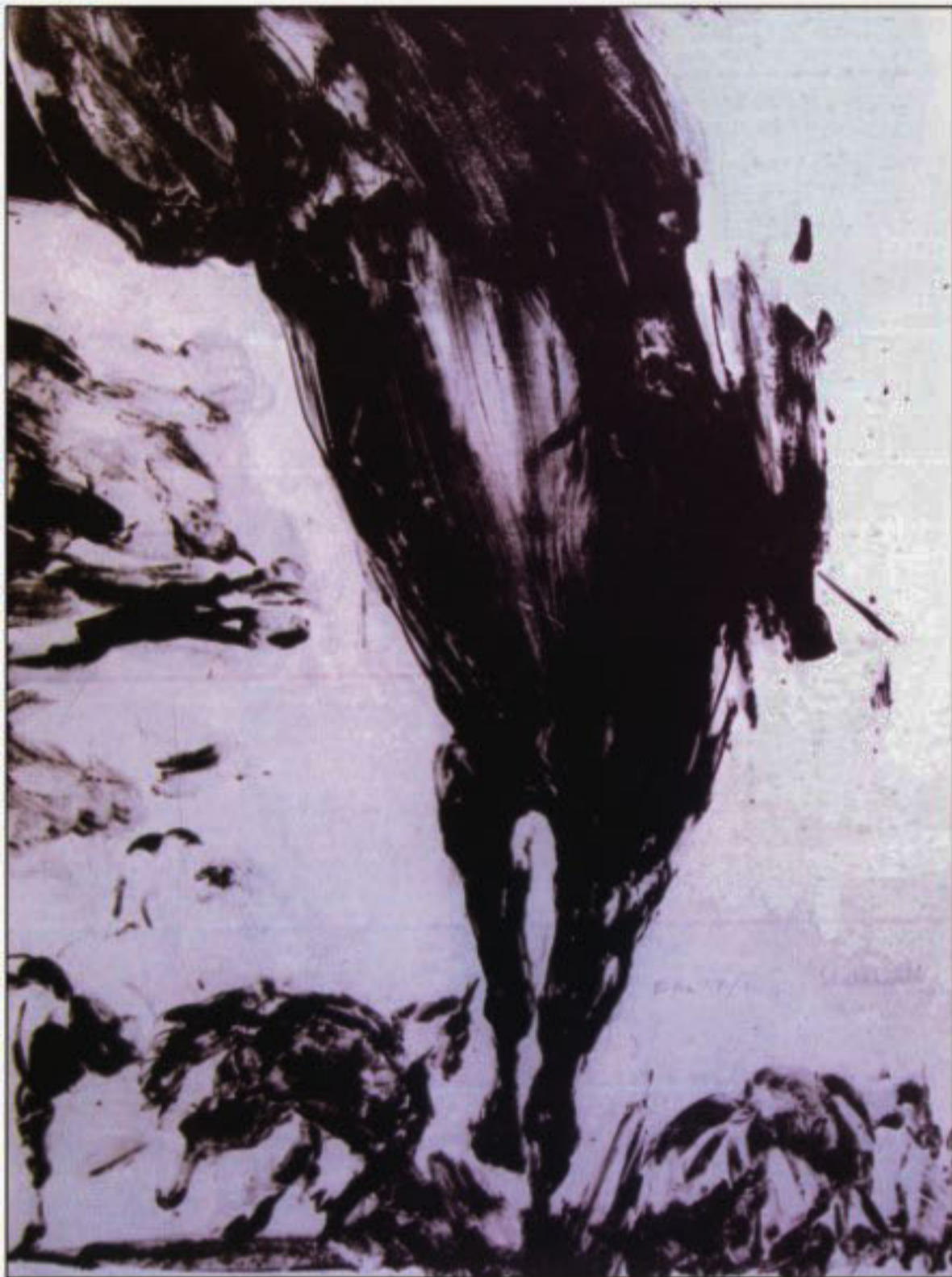
Wild Horse (Litho)

Shahabuddin Ahmed's solo art exhibition at Saju Art Gallery stands out for its featured mediums. The exhibition mainly includes drawings and prints. Ink has been predominately used for the drawings. A number of lithographs are on display at the exhibition. For litho, the artist has used metal plate to create bold prints. Litho is one of the complicated mediums but clearly visualises delicate lines and tones. The metal plate and the paper are positioned in a press and light pressure is used to transfer some of the ink. The original images are monochrome (pen and