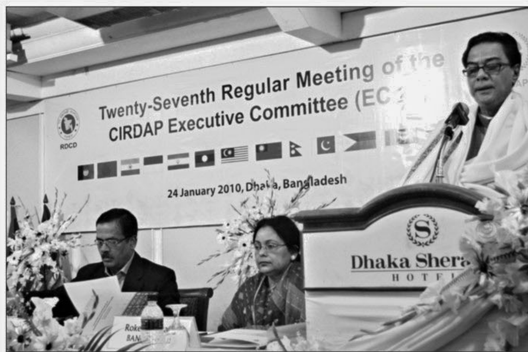
LGRD and Cooperatives Minister Syed Ashraf Islam speaks at the 27th regular meeting of the executive committee of the Centre on Integrated Rural Development for Asia and the Pacific (Cirdap) at Hotel Sheraton in the city yesterday. (Story on Page 3)

So, the matter should be reviewed and discussed thoroughly at the policymaking level to come up with a feasible solution to the crisis, they added.