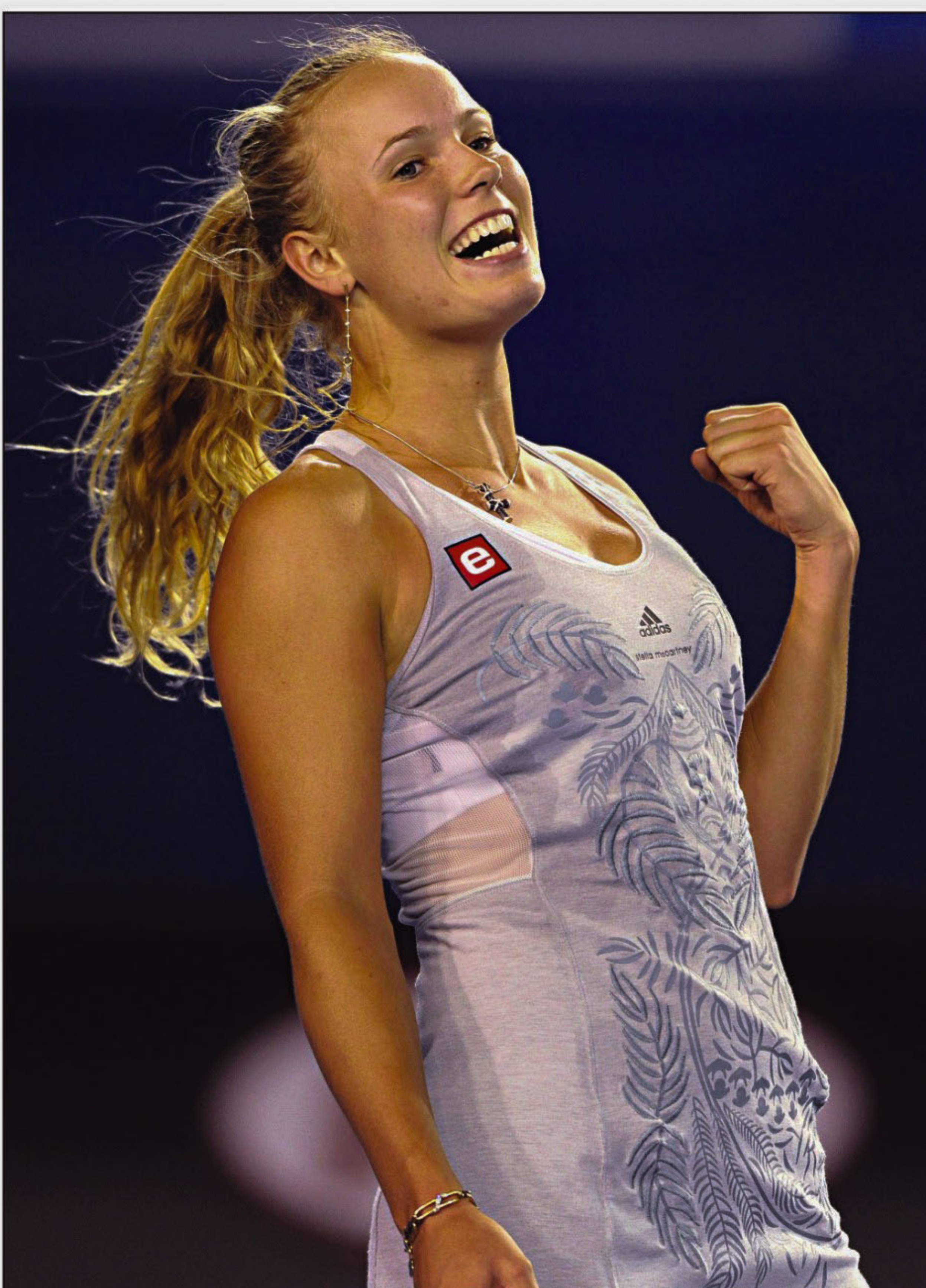
Caroline Wozniacki of Denmark celebrates her win against Shahar Peer of Israel during their Australian Open third round encounter in Melbourne on Saturday.