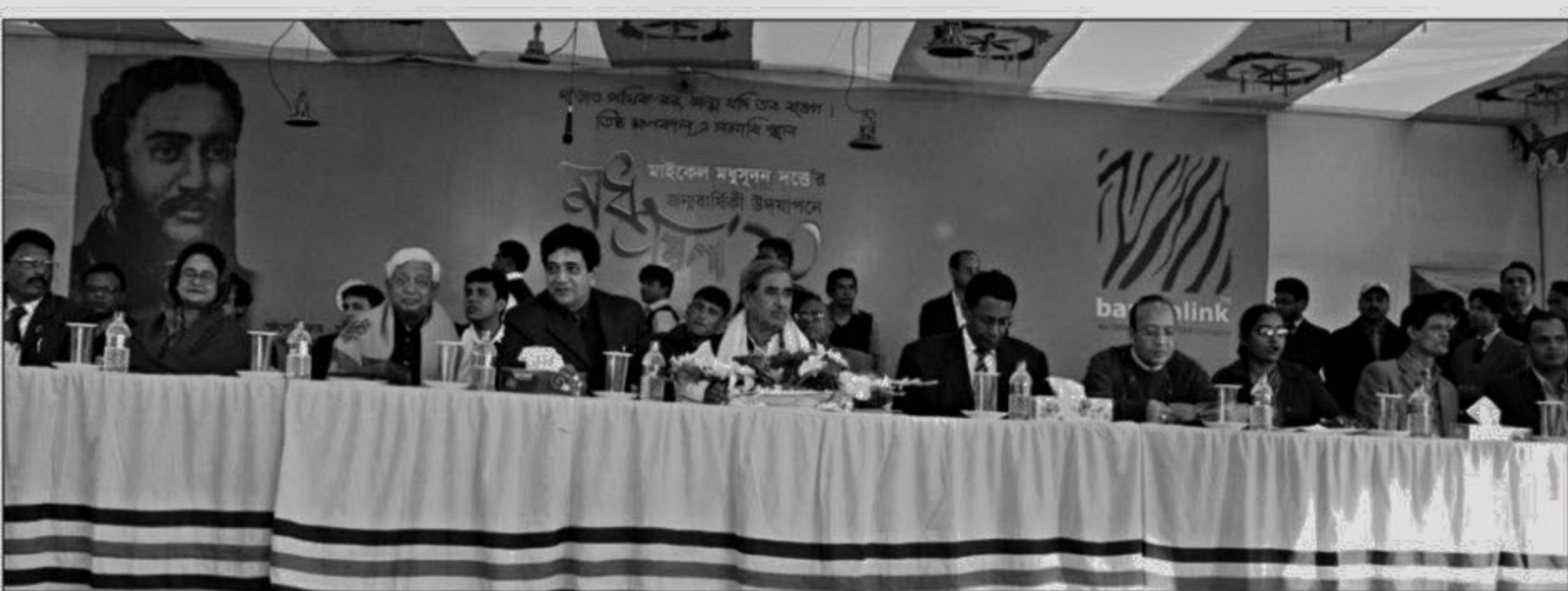
A discussion on the life of poet Michael Madhusudan Dutta was held at Michael Madhusudan Academy at Sagardari in Keshabpur upazila of Jessore district. The three-day Madhu Mela concludes today.