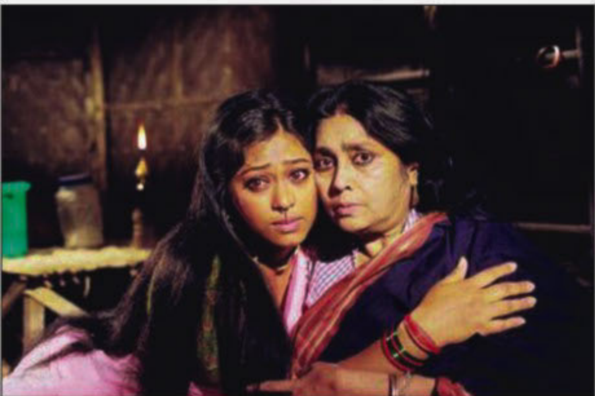
The film features the relentless struggles of a community of labourers living in Hatia Island.

The film was mostly shot on the island of Hatia as the story is based on the locale. The other spots were Dhonbari in Tangail, Hotapara and also at FDC.