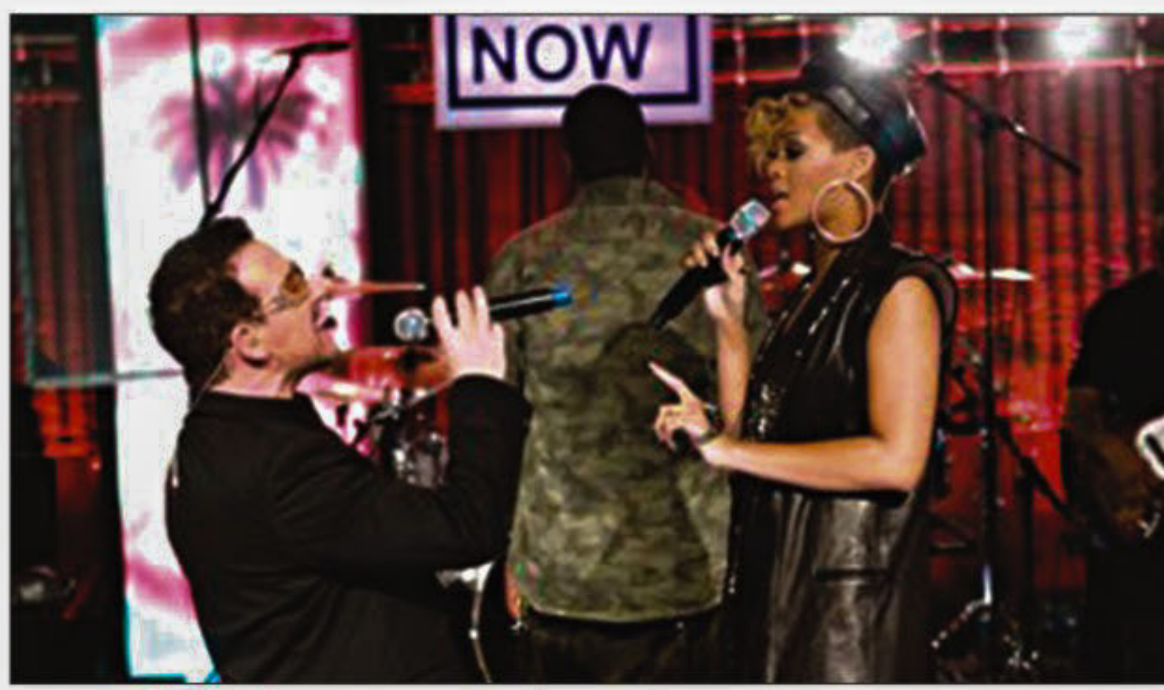
Bono, left, and Rihanna perform at the "Hope for Haiti Now: A Global Benefit for Earthquake Relief".

Since Haiti suffered the devastating earthquake on January 12 that killed more than 200,000 people, the entertainment