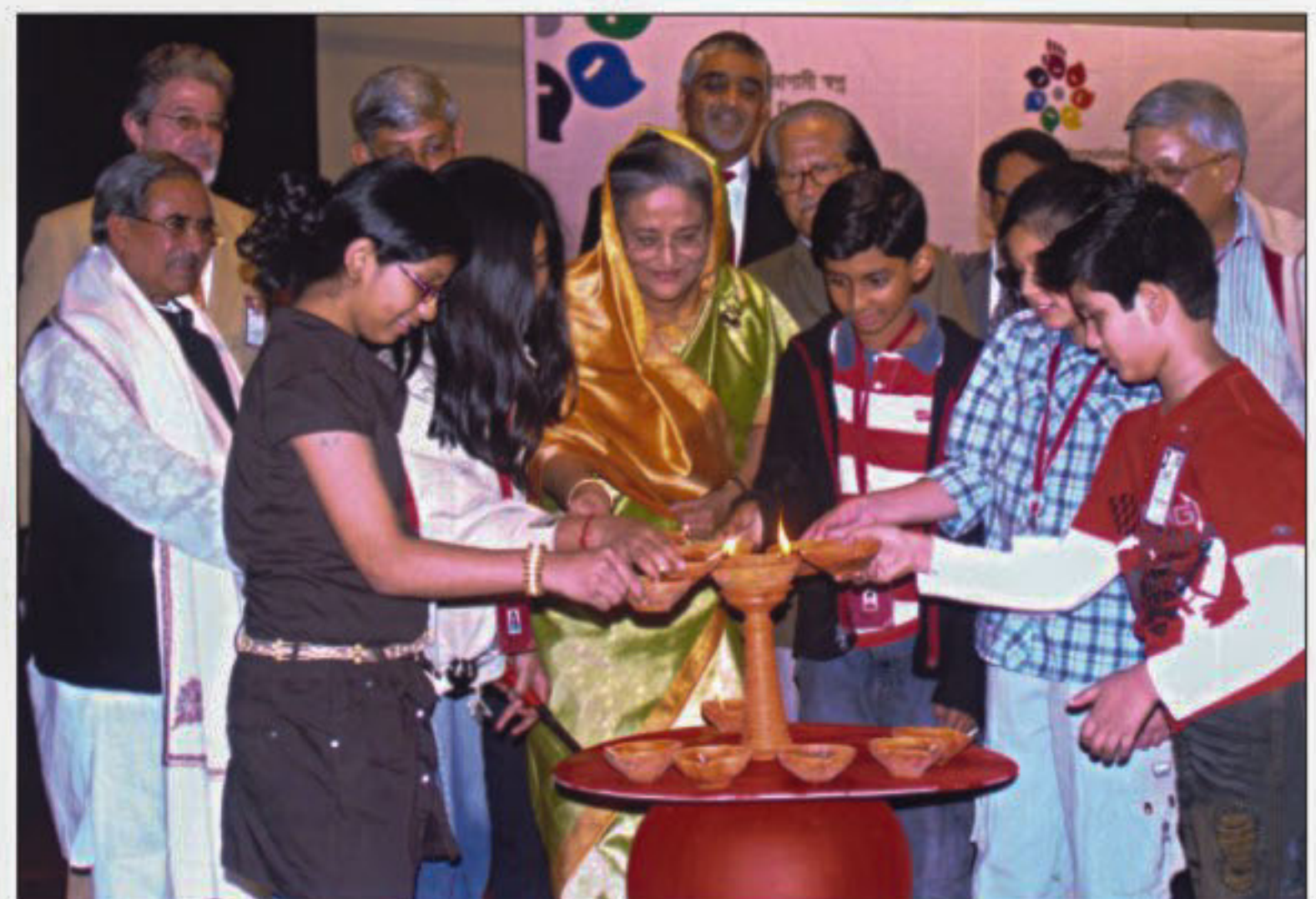
Prime Minister Sheikh Hasina inaugurates the 3rd International Children Film Festival by lighting a lamp at Osmani Memorial Auditorium in the city yesterday.

The children's film festival will be followed by traveling (mobile) film festival to be started from February 3 and to continue over the year across the country.