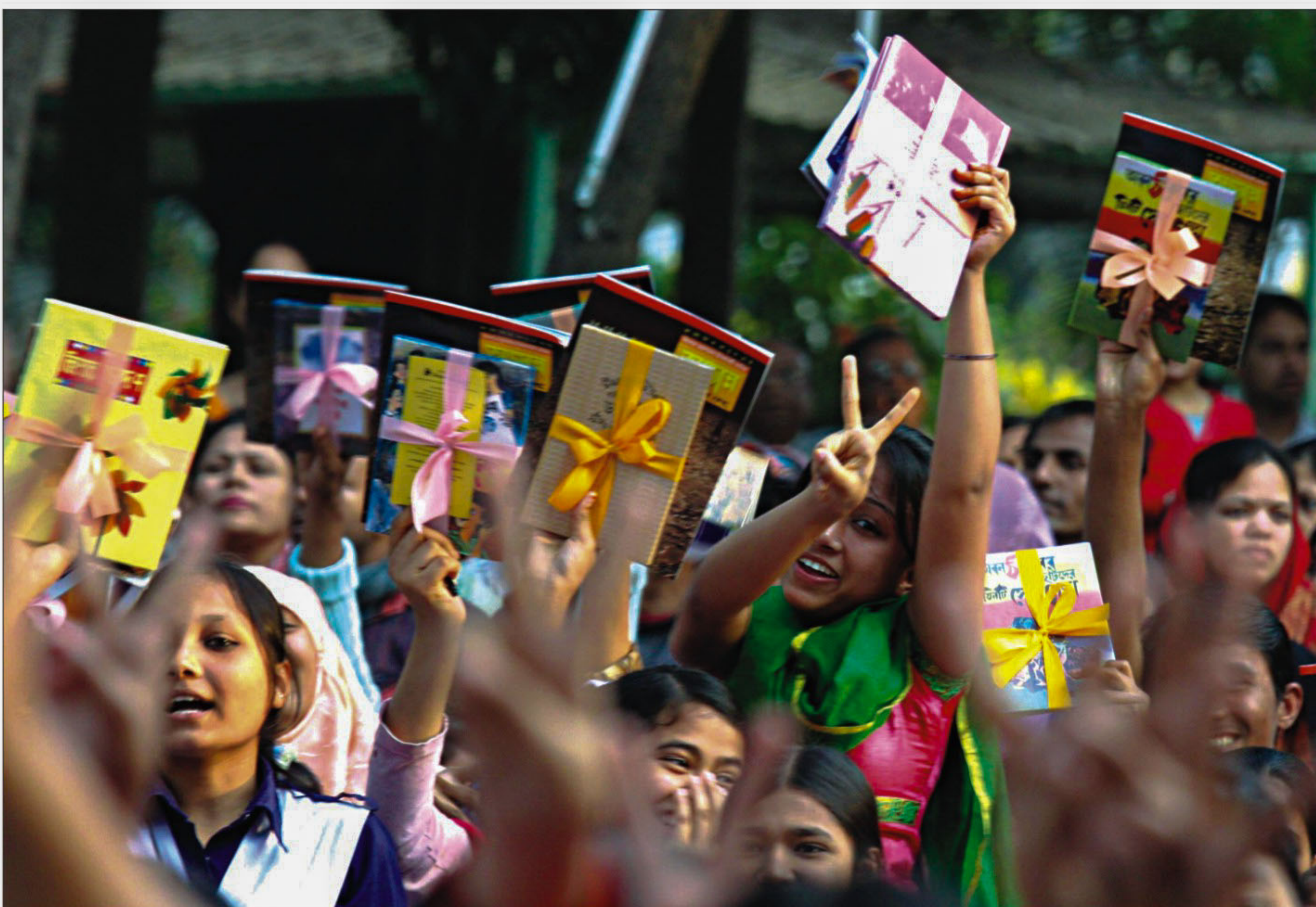
Winners of the book reading programme of Bishwa Sahitya Kendra hold their prizes at the prize giving ceremony at Ramna Batamul in the city yesterday, the last day of the two-day ceremony.