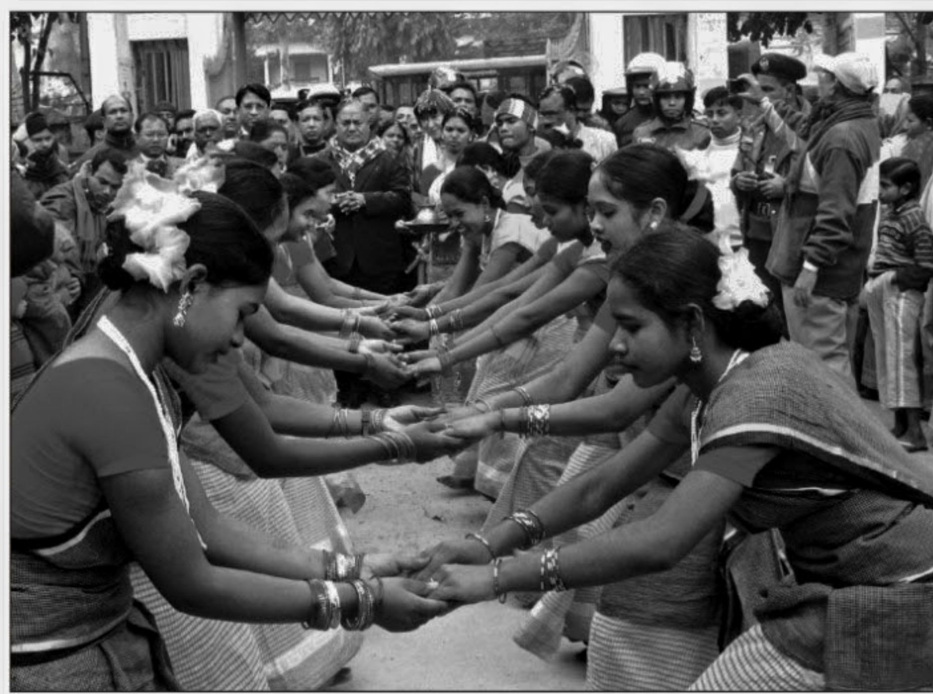
Indigenous girls perform a dance number at a cultural fair at Dinajpur Zila School yesterday.

Five DCC wards out of 90 were awarded for their performance in cleaning the city under the programme. Ward No. 84 won the 1st award while Ward Nos. 86 and 50 won the second while Ward Nos. 36 and 5 received the third awards. Some 48 organisations under these five wards were the awarded for their performance.