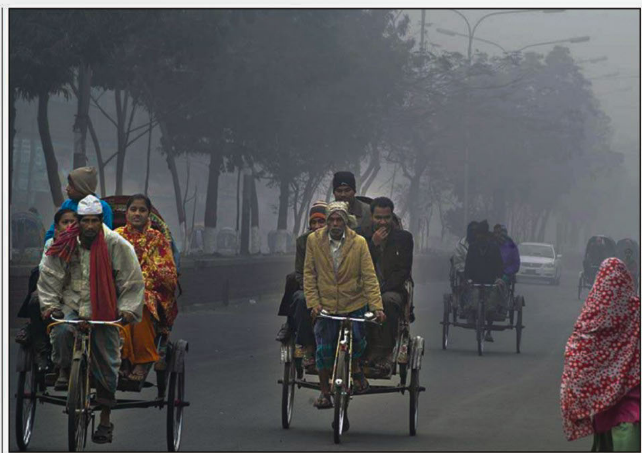
Although the biting cold subsided a little during the last two days, dense fog continues to persist in different areas of the country, much to the trouble of people and vehicles. The photo was taken from Narayanjanj town yesterday morning.

He said he would make a visit to see the conditions of toilets soon.