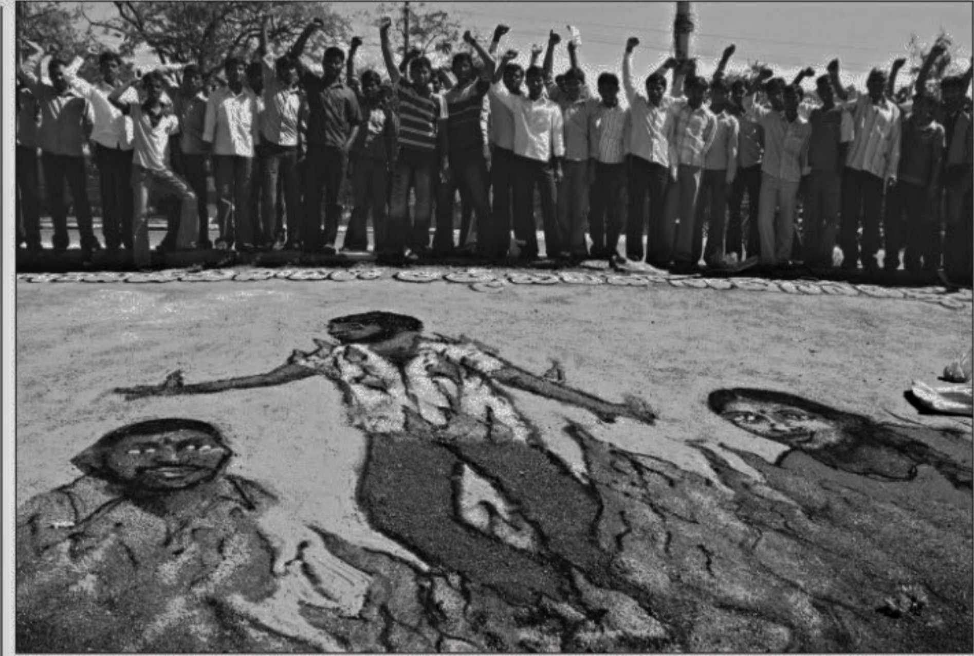
Indian students at Osmania University shout slogans next to sketches of students believed to have committed politically-motivated suicides for creation of separate Telangana state during a peace rally in Hyderabad yesterday.

Opposition candidate Sarath Fonseka accused the government of pushing senior army commanders to appear on state-run television to express their public support for Rajapakse.