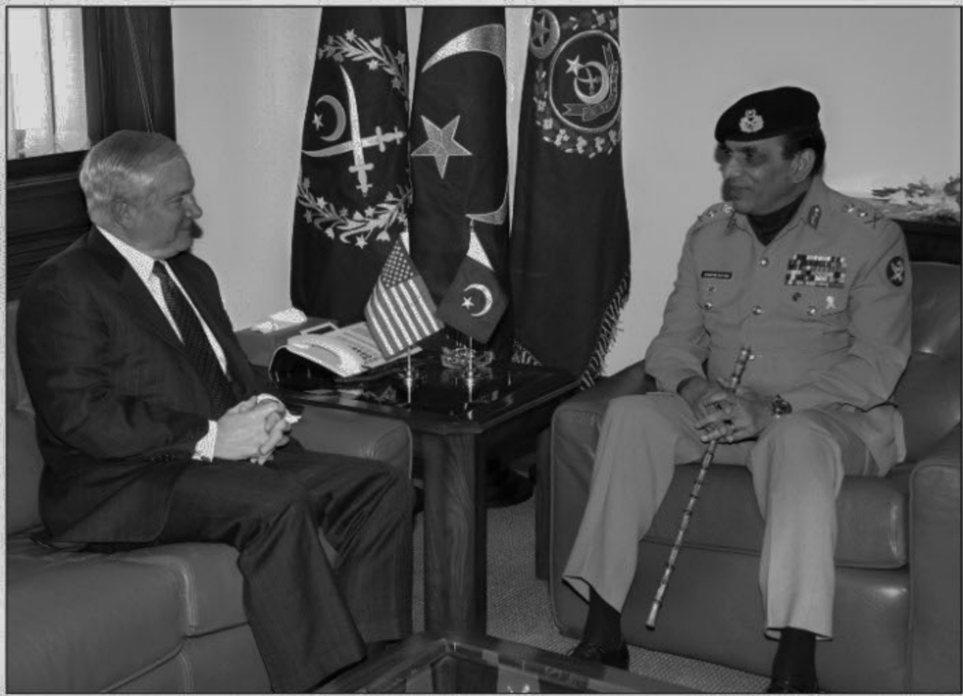
Handout photo shows Pakistani Army Chief General Ashfaq Kayani (R) speaking with US Defence Secretary Robert Gates during a meeting yesterday in Rawalpindi. Gates warned on Thursday that Taliban safe havens along the Pakistan-Afghanistan border must be tackled or both nations would suffer "more lethal and more brazen" attacks.