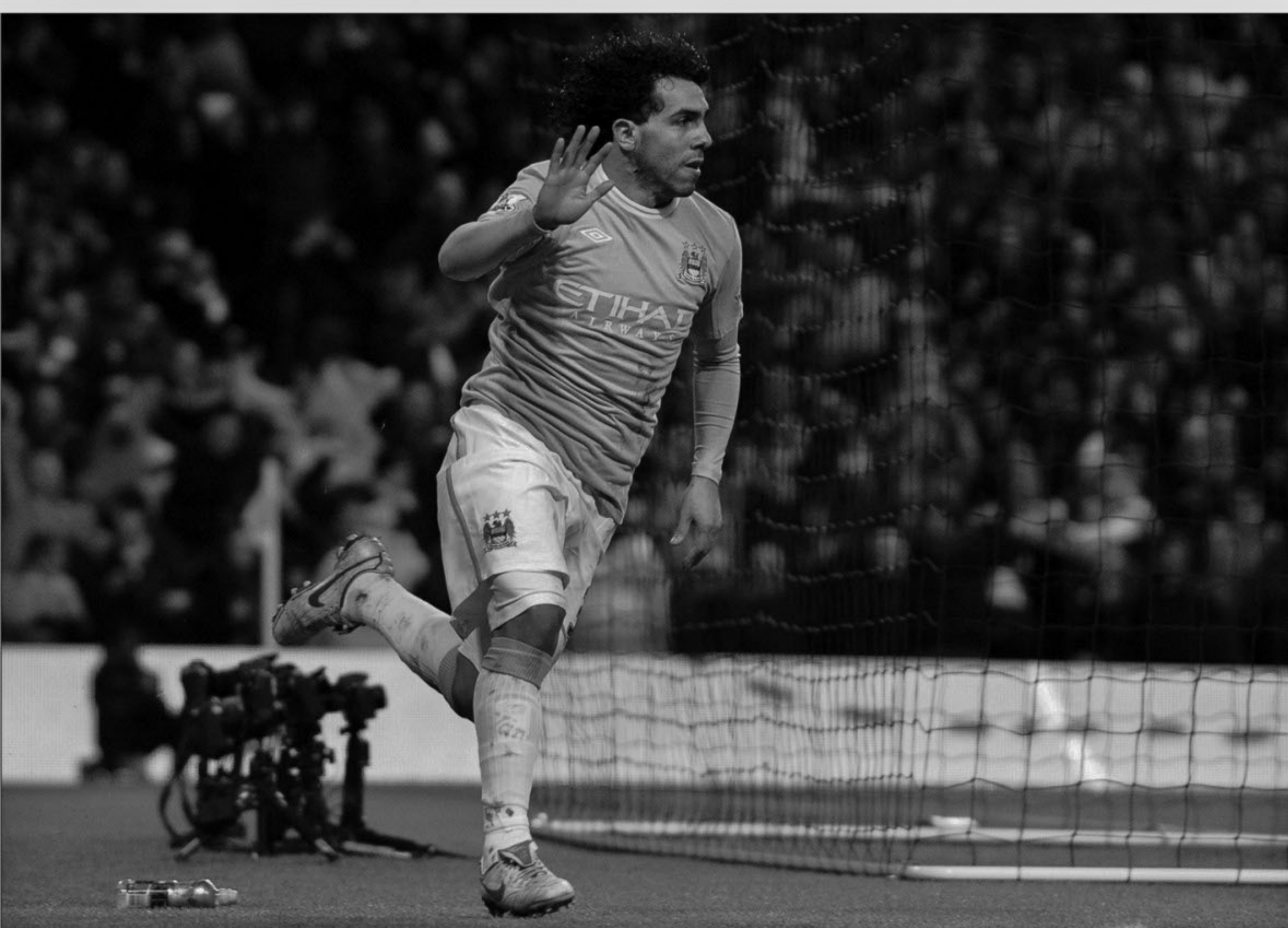
Manchester City striker Carlos Tevez celebrates his second goal against Manchester United during their League Cup semifinal first leg at the City of Manchester Stadium on Tuesday.